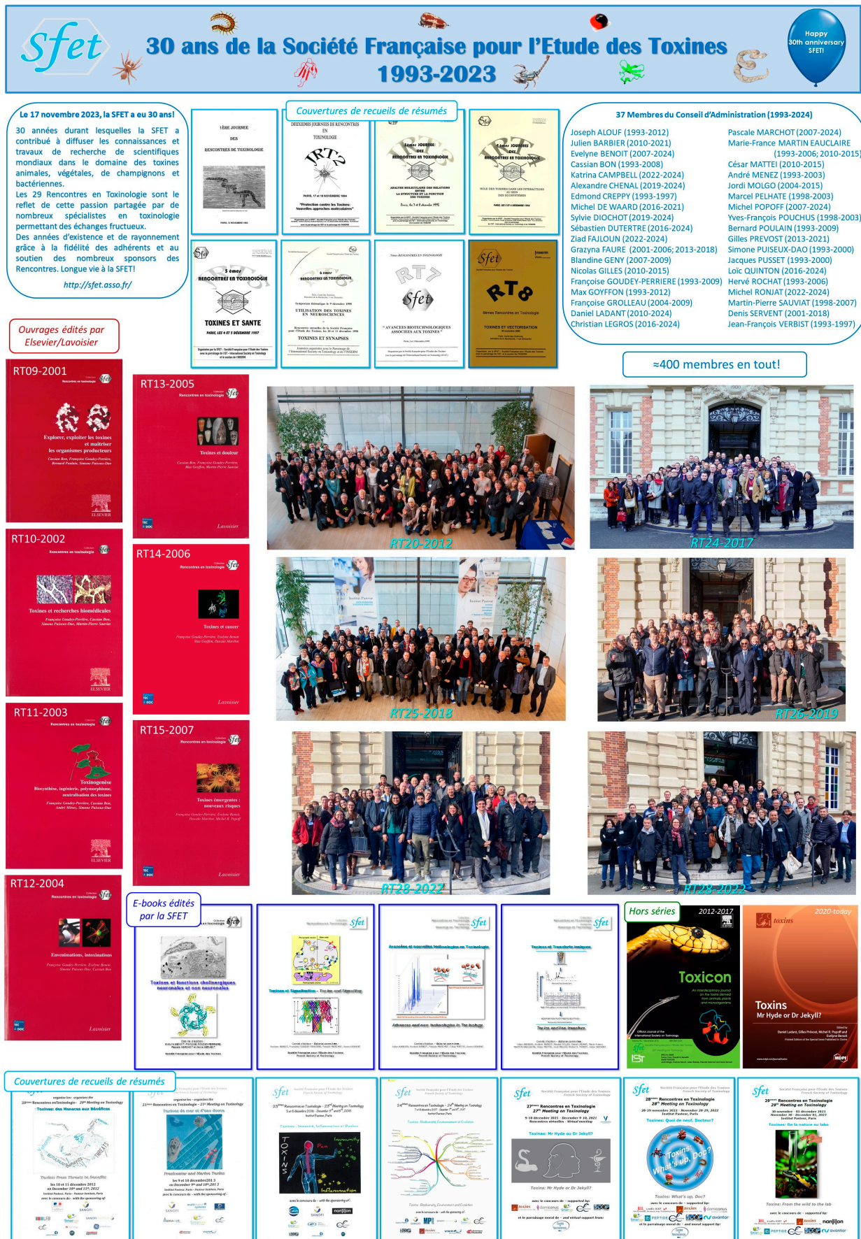
Figure 3. The 30th anniversary of the French Society on Toxinology (1993–2023).