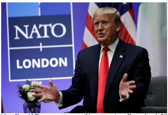
Then president Donald Trump gestures at a Nato summit on December 4, 2019. Last year, 11 of the 31 Nato members met the commitment to spend at least 2 per cent of their gross domestic product on defence, including the US at 3.5 per cent and Poland at nearly 4 per cent. This year, 18 Nato allies are expected to meet the commitment.

True, the US outspends all other countries on defence in maintaining a network of 750 bases across 80 countries, but Trump appears to conveniently overlook that this is America's own strategic decision.