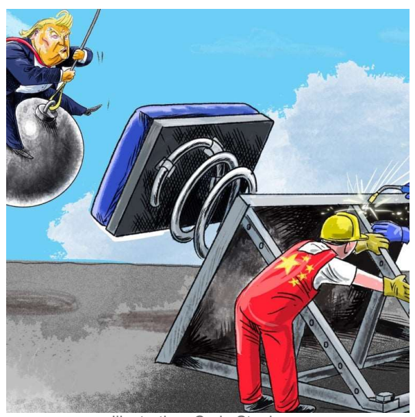
Illustration: Craig Stephens

As the countdown to the US presidential election begins, China and the European Union must prepare themselves for Donald Trump's potential second term. While individual efforts are essential, true power lies in the ability of China and the EU to develop a coordinated response.