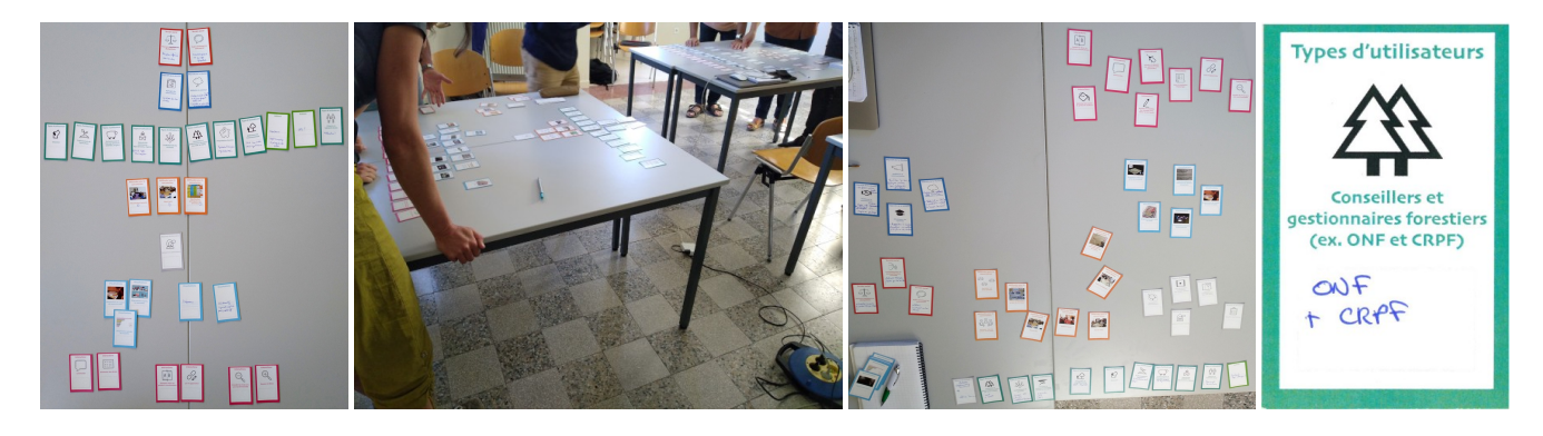
Figure 3: Pictures showing the organization of both groups and their final proposals during workshop II. The image on the right illustrates the appropriation of a card by writing, as a description was rewritten by a group despite being already on the card.

Supporting Interdisciplinary Research with Cards-based Workshops