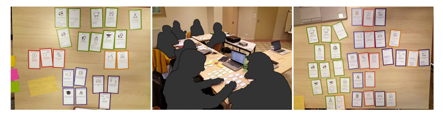
Figure 2: Pictures showing the organization of two groups from workshop I and their final meeting proposals