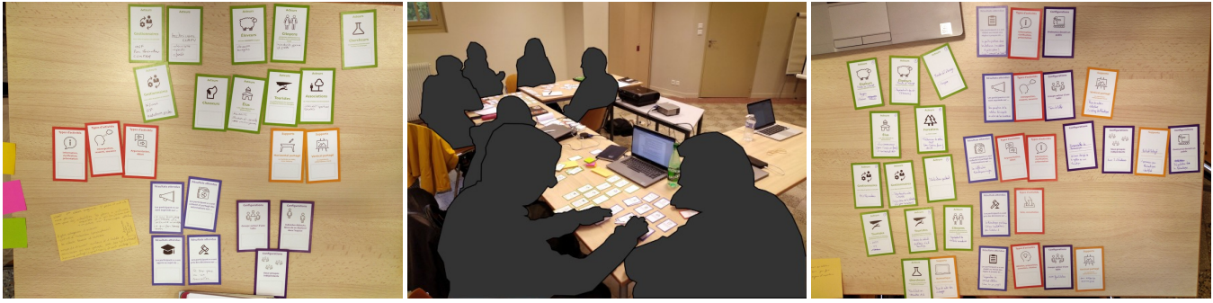
Figure 2: Pictures showing the organization of two groups from workshop I and their final meeting proposals