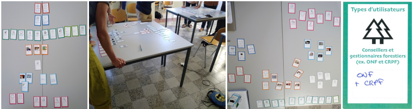
Figure 3: Pictures showing the organization of both groups and their final proposals during workshop II. The image on the right illustrates the appropriation of a card by writing, as a description was rewritten by a group despite being already on the card.