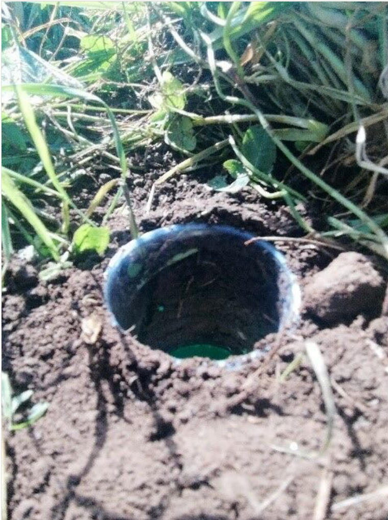
Figure 2. doi

Quality control: After collection, specimens were stored in ethanol (96%) before sorting. Specimens, adults and juveniles, were identified in the laboratory by a trained parataxonomist (Sophie Wallon) and organised following a system of morphospecies (Oliver and Beattie 1996). Final identification was done by the senior author (Paulo A.V. Borges).