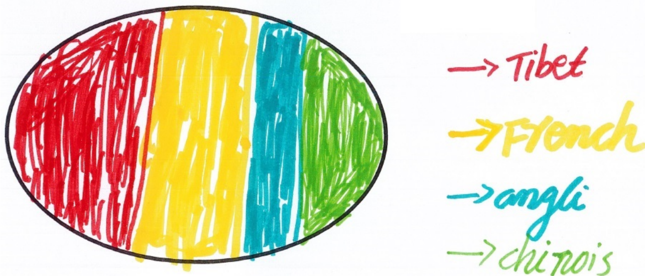
Fig. 2: Mo-1 – Typical quadrilingual repertoire declared by a woman in training as a caregiver (Education level: University) (Simon 2023)

Before further analyzing these data, it should be reminded, as pointed out by Pennycook & Otsuji (2015: 73), such self-assessments tell less about the actual use of languages than about the interviewee's representations about their languages: "While the readiness of these workers to discuss and negotiate their language use in such percentage terms is in itself intriguing (as part of popular discourse or local language ideologies), such comments [...] of course do little to capture the nature of actual linguistic interactions."