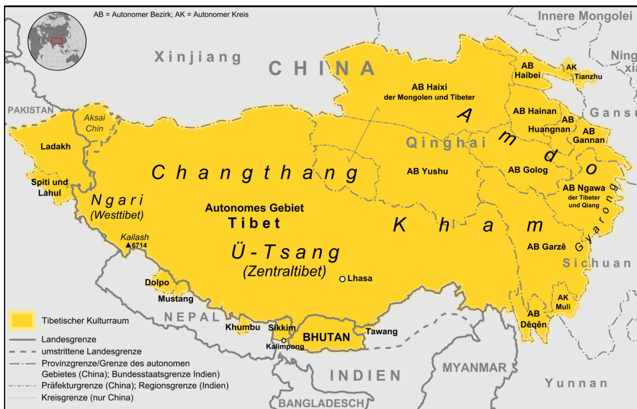
Fig. 0: Tibet's traditional and modern administrative units, showing the diverse regions where the interviewed families come from (Lencer 2008)