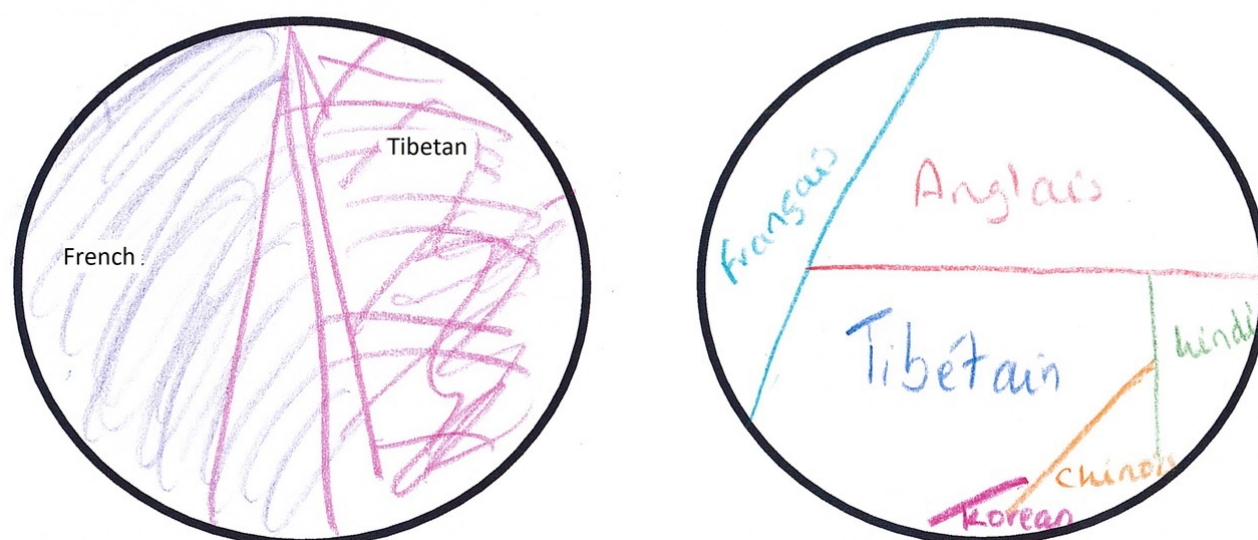
Fig. 4: Mo-3 and Da-3 self-reported language use for “yesterday” (Simon 2023)

While the mother only declares two languages – Tibetan and French, with some hesitation regarding their respective proportion, the daughter indicates no less than six languages, and comments Figure 4 as follows: