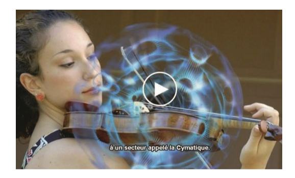
Fig. 1. Vibrations and music influence to the memory.

According to H. Platel, researcher in neuropsychology at the University of Caen "The pathways of music in the brain are much more complex than those of speech, for example, and seek different brain areas: music stimulates, relaxes, soothes pain, but also has the ability to increase plasticity of the brain and causes changes in synaptic connexions". For the professor, listening to music while working stimulates memory and makes feel less tired (Fig. 1).