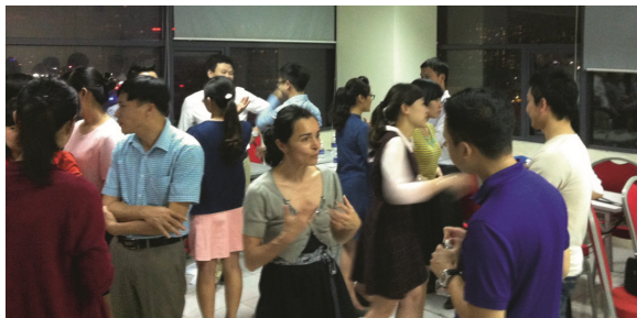
Fig. 2. Students during an exercise talking about their intelligences types

In an oral exercise, in circle we can make them speak in pairs on their types of intelligences (Fig. 2).