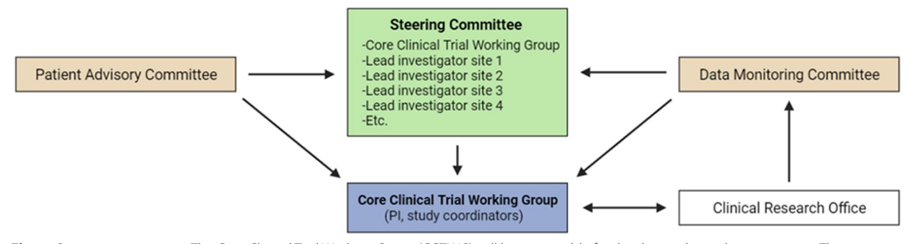
Fig. 3 Governance structure. The Core Clinical Trial Working Group (CCTWG) will be responsible for the day-to-day trial management. The steering committee (SC) consists of the CCTWG and the principal investigators of each participating site and is tasked with major decisions regarding the study progress and design. The Data Monitoring Committee (DMC) is responsible for the safety of participants and advises the SC based on the interim analysis. A Patient Advisory Committee has been appointed to advise the SC regarding any patient-related matters. The Clinical Research Office is responsible for, among others, monitoring the trial and for providing safety data that can be assessed by the DMC and be sent to the competent authorities

to baseline eGFR and salt and protein intake, since disease progression is associated with urinary concentrating defects [32, 33] and salt intake [34], and because urinary volume is largely driven by osmolar excretion when renal water reabsorption is impaired [11].