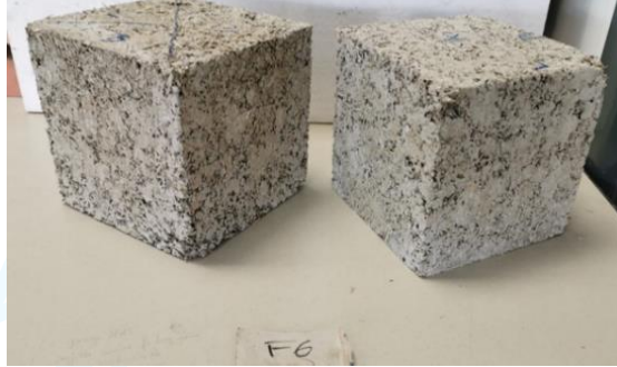
Figure1. Mechanical sample of load-bearing insulating concrete made with rape straws (BIP).