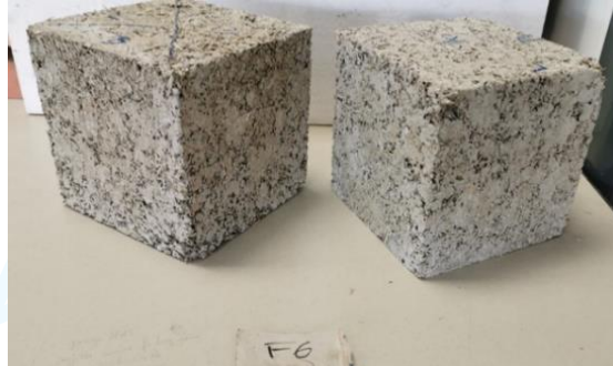
Figure1. Mechanical sample of load-bearing insulating concrete made with rape straws (BIP).