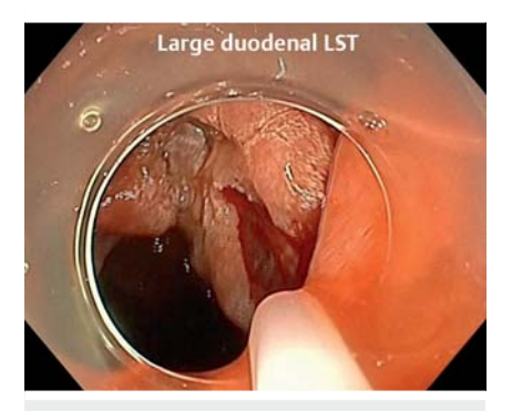
Fig.1 Large duodenal laterally spreading tumor.