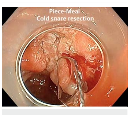
Fig.2 Piecemeal cold snare resection of the laterally spreading tumor.