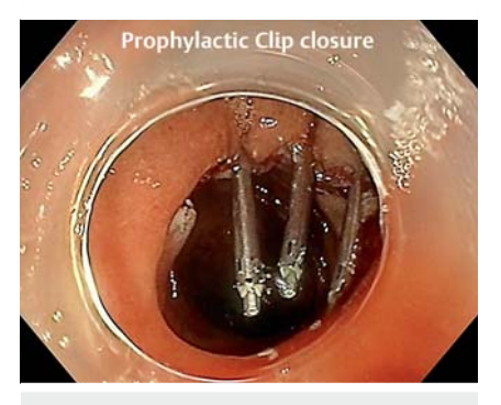
Fig. 3 Prophylactic clip closure.

Large laterally spreading tumors (LSTs) of the duodenum are considered by most experts to be very challenging benign lesions requiring endoscopic resection. Piecemeal endoscopic mucosal resection (EMR) is the gold standard but leads to a high recurrence rate and a risk of delayed bleeding.