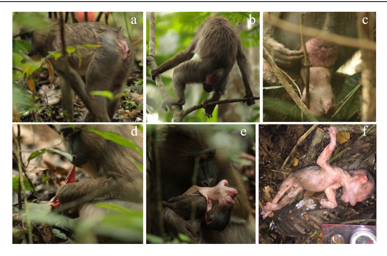
Fig. 1 Photos of key events observed during a daytime parturition that resulted in a stillbirth: a Parturient female mandrill the morning of the day of parturition. b Parturient female undergoing a contraction. The crown of the infant's head is visible. c Ongoing delivery