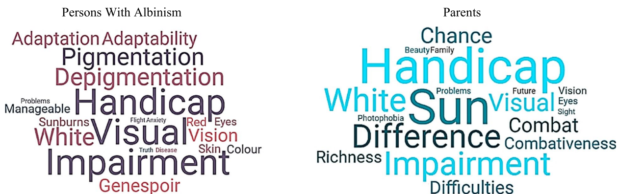
Fig. 1 Word clouds about albinism perceptions by PWAs and by parents

To read the word cloud: the larger the word, the more frequently it is cited; the shades of color hold no significance; they are solely used to enhance readability; the term “Genespoir” refers to the French Association for Albinism