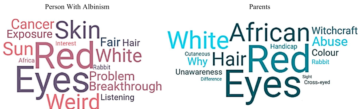
Fig. 2 Word clouds about societal representations of albinism by PWAs and their parents

To read the word cloud: the larger the word, the more frequently it is cited; the shades of color hold no significance; they are solely used to enhance readability