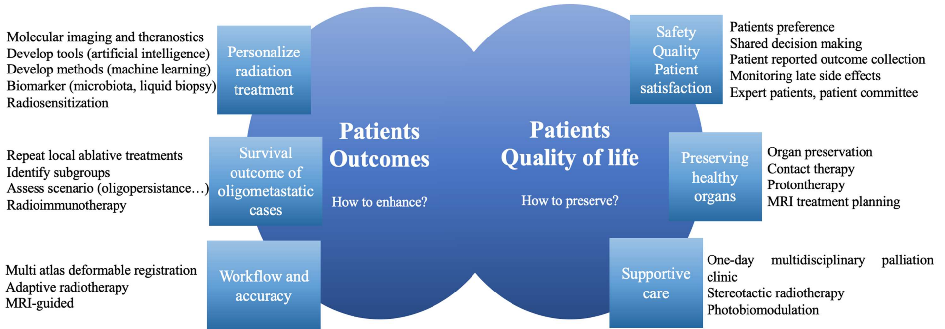
Figure 3. Landscape of radiotherapy development.