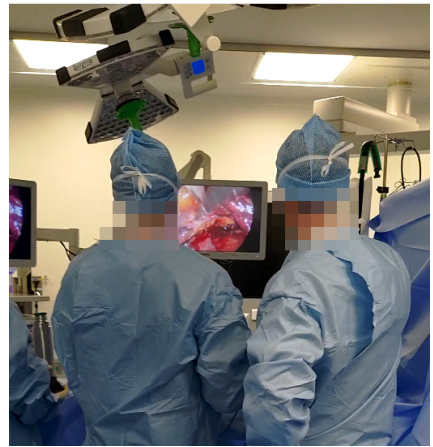
Fig. 1. A mentor and a mentee operating