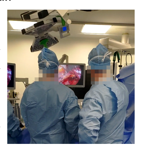
Fig. 1. A mentor and a mentee operating

In addition, different surgical techniques exist, such as open, laparoscopic, and robotic surgery, each one requir-