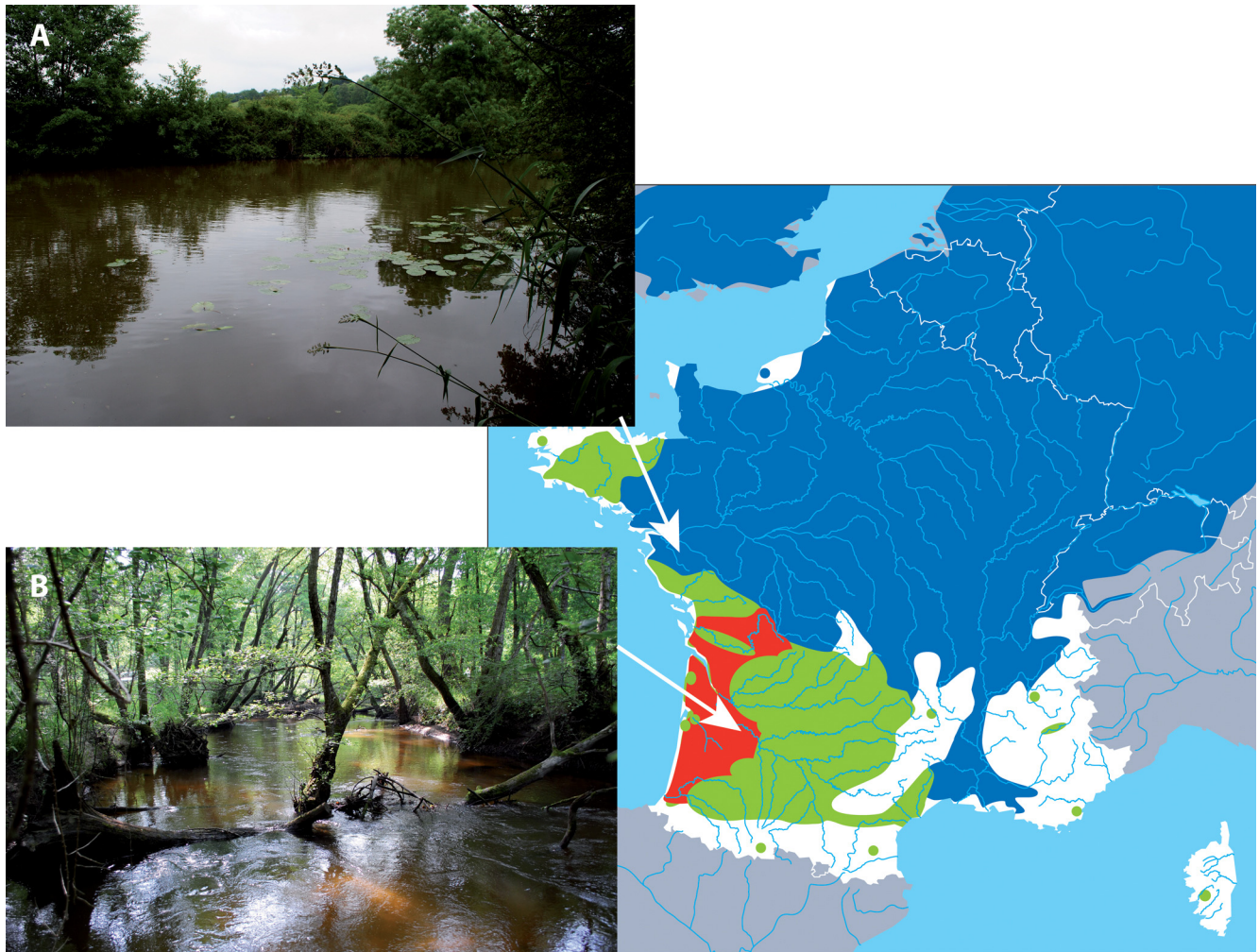
Fig. 3. Distribution area of the two pike species in France ( Esox aquitanicus in red, Esox lucius in its native area in blue and introduced in green) (modified and adapted from Keith et al. , 2020; Denys, 2017), with examples of typical habitats of both species: the Sèvre nantaise (A) as a large river with many aquatic vegetation and the Ciron stream (B) as watershed with a poor environment (sandy substrate and no aquatic vegetation except stumps); credit photos: G. Denys.

Length and weight averages were compared using a U test of Mann–Whitney after having checked a non-normal distribution with a Shapiro–Wilk test ( p -value < 2.2 \times 10^{-16} ). Length–weight relationships were calculated following the method of Kuriakose (2014) using the equation \log_{10}W = \log_{10}a + b \log_{10}L , where a is the intercept on the Y -axis of the regression curve and b is the regression coefficient (Ricker, 1975). LWRs were calculated for unsexed individuals, as the sex determination is not done by the angling federations nor the French Agency of Biodiversity, because it is not included in their protocol of surveys. The 95% confidence limits of a and b (CL 95%) were also computed (Froese, 2006) for both equations.