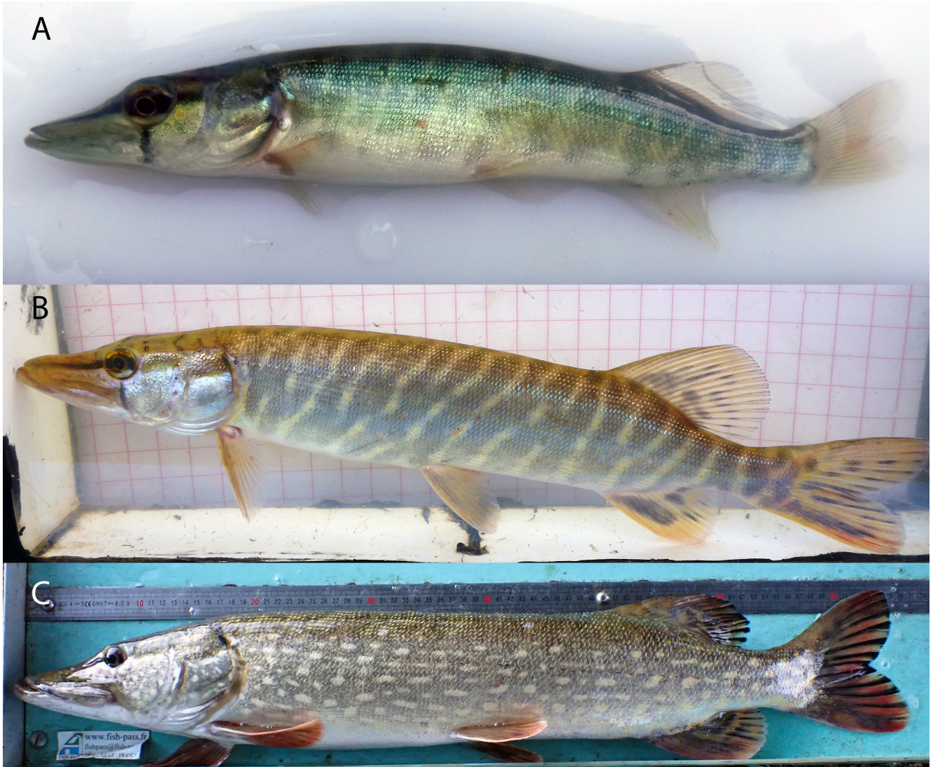
Fig. 1. The northern pike Esox lucius : 92 mm from the Vie river at Poiré-sur-Vie (A), 278 mm from the Yser river (B), 770 mm from the Oise river (C); credit photos: Hydrosphere, Fishpass, OFB.

Length–weight relationships (LWRs) constitute primary knowledges used for fish management and stock assessment. They are necessary for estimating fish biomass from sampled length data, as well as fish growth, and are useful for ecological modelling (Froese, 2006). For that, length L and weight W are related with a mathematical formula W = aL^b including two parameters: a coefficient a and the allometric growth parameter b (Keys, 1928). These two parameters are essential to understand the growth of each species. Each pike species has at least one LWR published study (e.g., Kapuscinski et al. , 2007; Verreycken et al. , 2021; Giannetto et al. , 2016; Huo et al. , 2017; Parker et al. , 2018), except the Aquitanian pike. Irz et al. (2022) published also a LWR of “ Esox lucius ” from the ASPE database collecting lengths and weights data of French fish species collected by the French Agency of Biodiversity (OFB) since 1980s, but without distinguishing the two species. Working on data from badly identified taxa can induce some bias on their management (Bortolus, 2008).