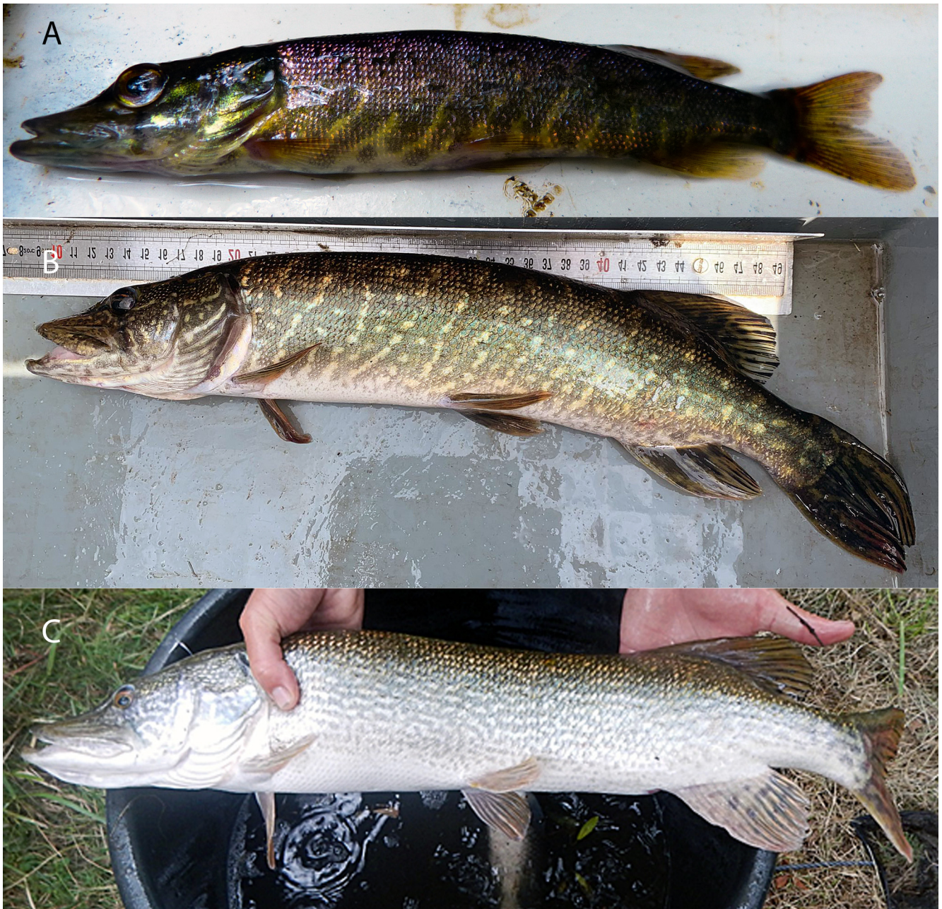
Fig. 2. The Aquitainian pike Esox aquitanicus : 111 mm for 9 g from the Ciron stream (A), 480 mm for 816 g from the Courant mort brook (B); 747 mm for 3200 g from the Jalle du Sud stream (C); credit photos: FDAAPPMA47, FDAAPPMA40, FDAAPPMA33.

known to have been restocked. Identifications were based on morphological (Denys et al. , 2014; Jeanroy and Denys, 2019) or molecular data (Denys et al. , 2014, 2018; Denys, 2017). Thus, our dataset is composed by only populations already characterized as pure Aquitainian pike according to morphological or molecular data from previous studies (Denys et al. , 2014, 2018; Denys, 2017). Total length ( L in cm) was measured to the nearest millimeter and weight ( W in g) was determined with a digital balance to an accuracy of 0.1 g. Additional data ( n=338 ) from locations already known to shelter Aquitainian pike without any sympatry with the allochthonous species were added from the ASPE