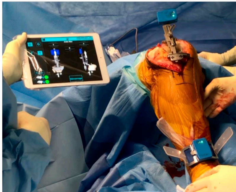
Figure 1. Navigation setup with software and sensors.

robotic assistance [6–8]. Accelerometer-based sensor navigation has also emerged, using an independent mass-spring system that measures linear acceleration in all three space planes. Accelerometer-based navigation is a portable surgical navigation system that does not use a large computer console for TKA (Figure 1). The first validation study about this system was in 2011 (cadaveric study) [9]. Accelerometer-based navigation is a hand-held, sterile device used within the operative field to determine the resection planes of distal femoral and proximal tibial cut, analyzing the hip rotation center and the femoral mechanical axis. These wireless, imageless systems collect data intraoperatively and display the data directly on pods attached to the femoral and tibial resection guides. These systems guide resection angles in the coronal and sagittal planes, and also can confirm alignment accuracy of cuts after resection. Unlike other assistive technologies, this system does not need intra-bone captors or preoperative 3D imaging. All these navigation technologies aim to make prosthetic positioning more accurate in usual situations by choosing angular values for bone cuts, but also to be able to bypass obstacles to conventional techniques (bone callus, extra-articular deformity, intramedullary material).