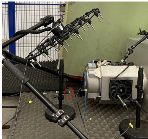
Figure 1: Experimental setup with array facing the induction motor and a reference microphone (marked in red circle).