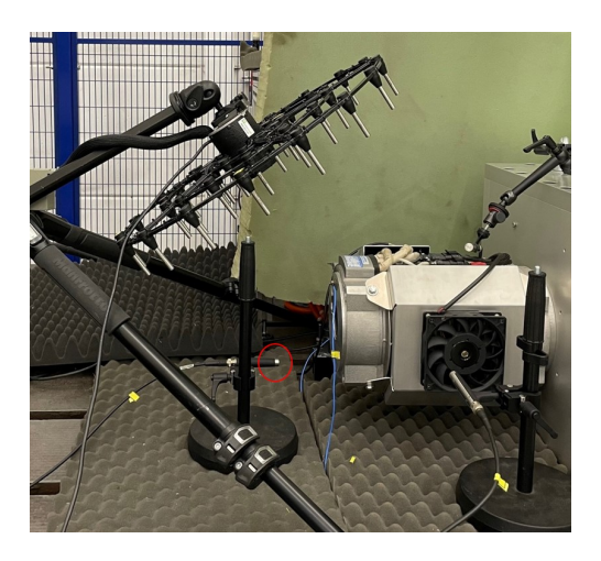
Figure 1: Experimental setup with array facing the induction motor and a reference microphone (marked in red circle).