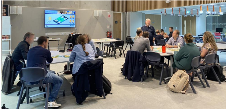
Fig. 1. Workshop at the SEFI Annual Conference in Technological University of Dublin, September 2023

To help disseminate and expand on these results, a workshop was held at the SEFI Annual Conference held at Dublin Institute of Technology in September 2023 (Fig 1).