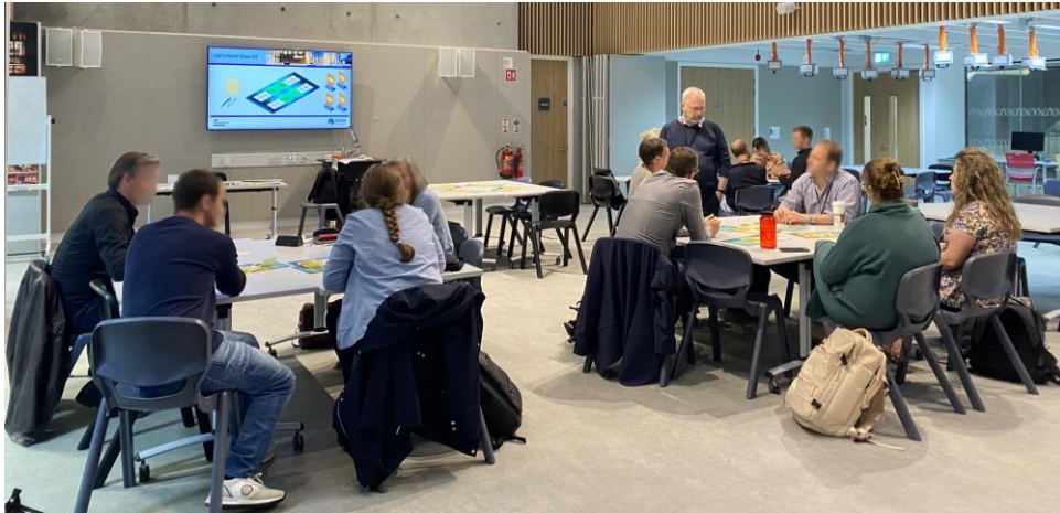
Fig. 1. Workshop at the SEFI Annual Conference in Technological University of Dublin, September 2023

To help disseminate and expand on these results, a workshop was held at the SEFI Annual Conference held at Dublin Institute of Technology in September 2023 (Fig 1).