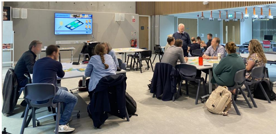
Fig. 1. Workshop at the SEFI Annual Conference in Technological University of Dublin, September 2023

To help disseminate and expand on these results, a workshop was held at the SEFI Annual Conference held at Dublin Institute of Technology in September 2023 (Fig 1).