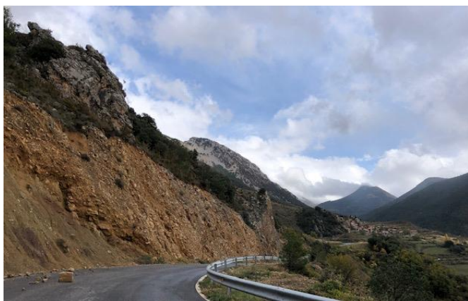
Fig 8. Landslide on a road in Alt Urgell