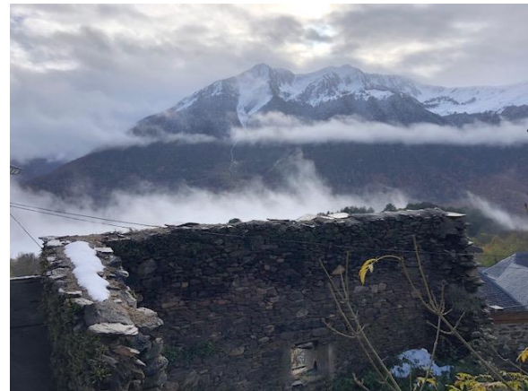
Fig 16. Ruin of an old house in Vilamòs, Val d’Aran (@RicardMoren, 2019)

Apart from adaption to slowness, one way to have faster broadband Internet access is by implementing rural DIY Internet connections, as it happened in the UK (Moss, 2015). In any case, this is an issue that the Catalan Government’s 5G strategy has been trying to tackle since 2019, 19 albeit still with uncertain results. In addition to 5G, a semi-public Spanish hi-tech company is planning to open new avenues for businesses in rural Spain by offering fibre optic or broadband services (Álvarez, 2020). However, for some immigrant entrepreneurs with retail business projects, one of the greatest challenges for economic sustainability is the local bureaucracy in some municipalities. Thus, searching for entrepreneur-friendly villages can become a priority before migrating: “We were looking for a quiet place... We were looking for small businesses opportunities. We wanted to work for ourselves. Sometime later we found that in a village near here the municipal council was looking for families with children, but they told us that we had to submit a [business] project. I told them that I didn’t want to write projects, and we kept on searching until we found a business opportunity in this hamlet” (EC-37-SA-female-YC). In other words, the attitude of municipal governments matters.