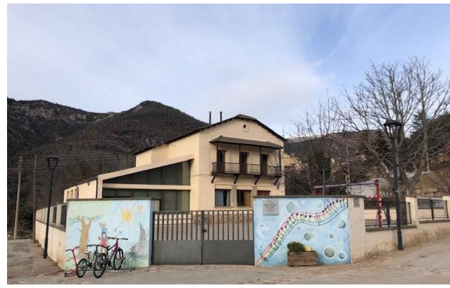
Fig 19. Rural school in Tuixent, Alt Urgel