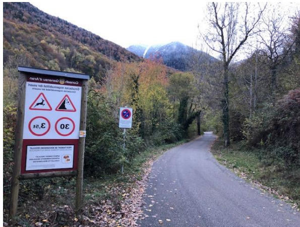
Fig 5. Rural road in woodlands of Val d'Aran (@RicardMoren, 2019)

'As You Like It', 13 Shakespeare shows woodlands and broader pastoral life as productive spaces where 'positive' transformation takes place (Robinson, 2016).