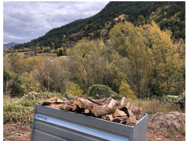
Fig 6. DIY wood management in Alt Urgell

Interestingly, the current situation in Catalonia and other European countries is quite the opposite of the situation in England during William Shakespeare's times, when climactic and demographic pressures led to the overexploitation of woodlands. This brought about a fuel crisis, environmental controversies and a 96% increase in wood and timber prices in a twenty-five-year period in the late 16 th century (Martin, 2015).