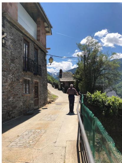
Fig 17. Elderly man walking in Canejan, Val d'Aran