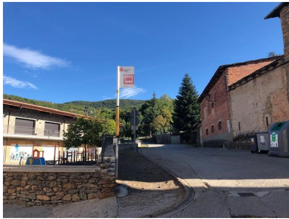
Fig 9. Bus stop in Alàs, Alt Urgell