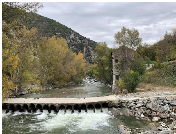
Fig 3. River Segre in Pont de Bar, Alt Urgell (@RicardMoren, 2019)

Thus, if policy-makers want to encourage human repopulation in the Lleida Pyrenees, all municipalities (and other relevant public authorities) have to be helped to make wastewater treatment a priority in their policy plans. Repopulating hamlets with more human beings instead of other species would avoid land abandonment, which combined with climate change can make (extreme) floods another key environmental challenge, as the words of an immigrant entrepreneur illustrates: “Land abandonment worsens the impact of floods caused by extreme rain... water with garbage flows down, damaging fields and paths below... some ancient water channels should be restored in order to prevent floods” (EC&ENV-34-SA-male-NC).