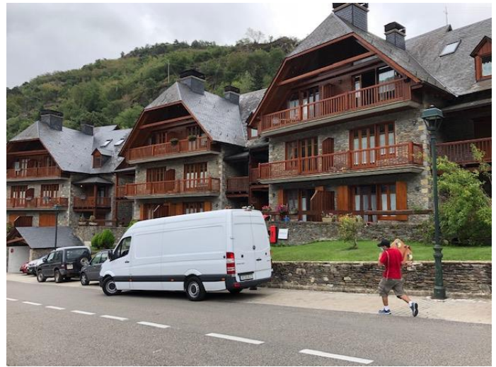
Fig 14. Deliveryman in Es Bòrdes, Val d'Aran

Bearing that in mind, some immigrant entrepreneurs suggested, the 'place branding', transport services and international promotion of hamlets in need of repopulation should be improved. This would also be helpful for complementing/competing with Andorra, the closest 'cosmopolitan' territory. In addition, better informing citizens about the real socio-economic situation and services available in hamlets would help to prepare potential immigrants for what they can expect to find in daily life in the mountains (e.g., the honest pros and cons for young people thinking about moving to the mountains in order to start life projects): "Proposals like building new mountain railways or a more efficient bus system and a better promotion of the hamlets on the Internet are fundamental" (EC-22-SA-male-NC).