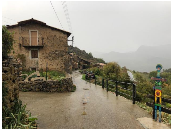
Fig 15. Arts & crafts in La Vansa-Fórnoles, Alt Urgell

Thus patience and adaptation to a slow pace of life are also important skills when developing new businesses in mountain hamlets, including sometimes adapting to slow and intermittent Internet and WiFi connections: “For my artistic business, I have a website and social media like Facebook and Instagram... Mobile phones work well in this part of the village, but not in the outskirts. When there are snowstorms, the electrical grid breaks down... Anyway, I know that the Internet is not going to work here like it does in the city. The Internet is not as fast, but... you can get used to slow Internet access” (EC&SC-31-SA-female-NC).