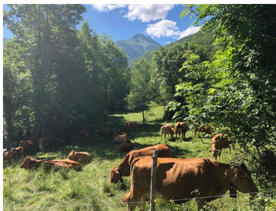
Fig 7. Cattle in pastures of Es Bòrdes, Val d'Aran