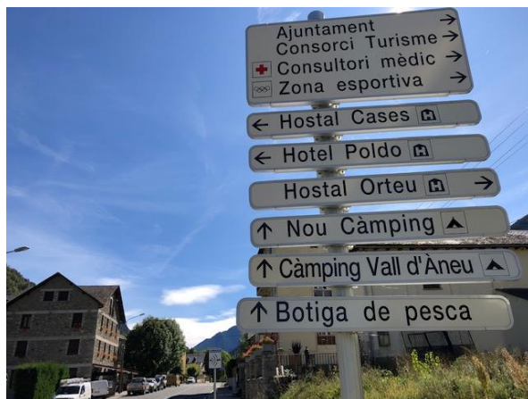
Fig 11. Touristic sign in Guingueta d'Àneu, Pallars Sobirà (@RicardMoren, 2019)