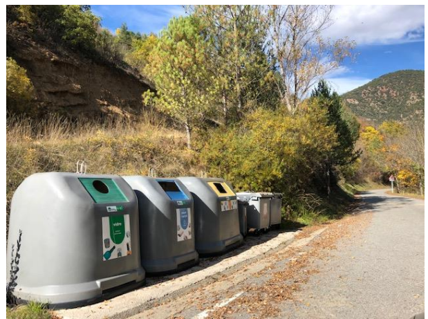
Fig 4. Recycling containers in Cava municipality, Alt Urgell (@RicardMoren, 2019)

In addition, solid waste management is another environmental challenge highlighted, albeit to a lesser extent, in some villages, particularly during peak tourist periods: “Garbage collection is fine in low seasons but overwhelmed in the summer... Containers are far from the village centre. The bar generates a lot of waste during the summer and sometimes containers are full of waste, so some days the bartenders have to carry the waste from the village to the county capital themselves” (EC-43-SA-female-NC).