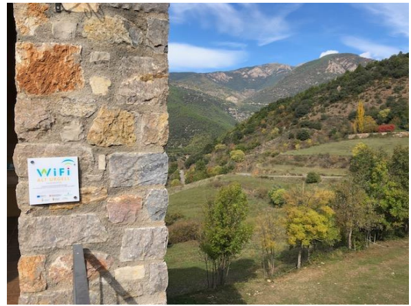
Fig 10. WiFi sign in Arsèguel, Alt Urgell (@RicardMoren, 2019)