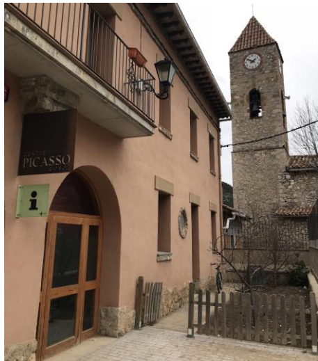
Fig 13. Picasso Museum in Gósol, Berguedà