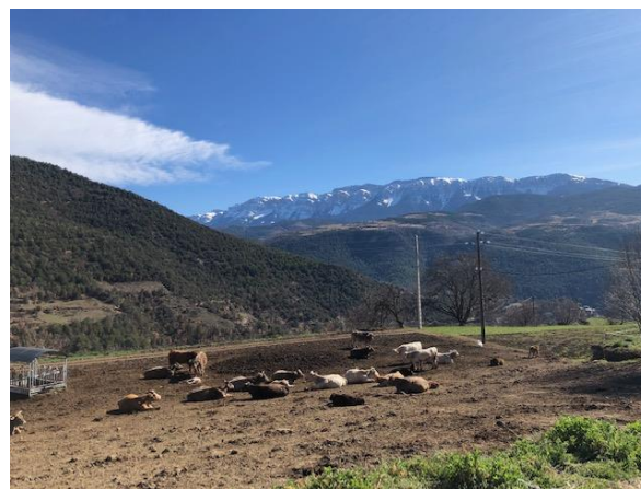
Fig 12. Cattle on a farm in Estamariu, Alt Urgell (@RicardMoren, 2020).

In some cases, multiple jobs, DIY and internationalisation as ways of overcoming seasonality are made possible thanks to the Internet, particularly in hamlets with a fast and reliable broadband connection.