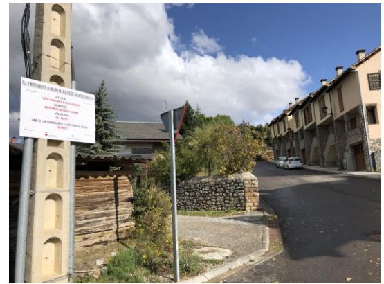
Fig 20. Second home housing estate in Prats i Sansor, Cerdanya (@RicardMoren, 2019)