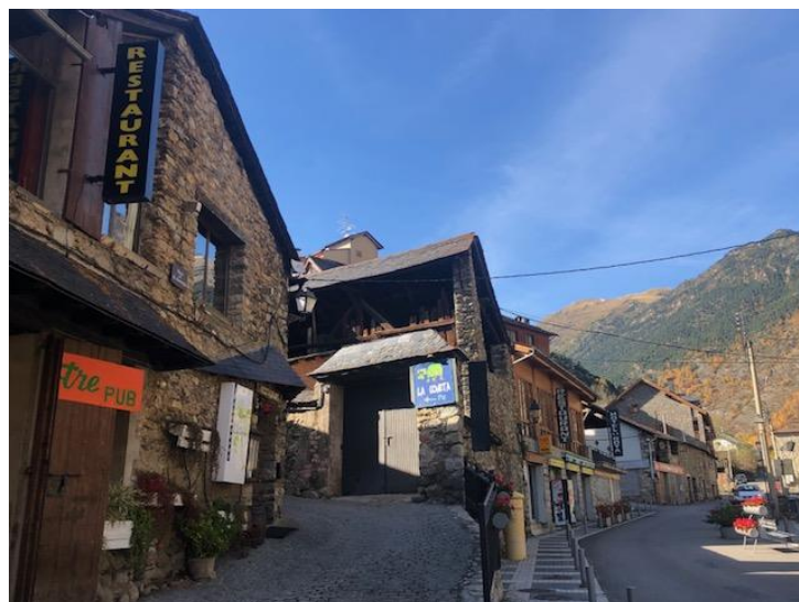
Fig 18. Pubs, restaurants & hotels in Espot, Pallars Sobirà

In order to rejuvenate mountain populations in the short or middle term, attracting families with small children is a must, which makes access to schools a key challenge. The importance of the rural schools goes beyond just the educational options available. Rural schools are perceived as sociocultural engines and as seeds of (possible) future sustainable development for the whole village: "When I arrived here [in the mid 1980s], we [as parents] had a lot of cultural initiatives in the school, and today some of them are still there" (SC&EC-68-SA-male-YC). Thus, a variety of voices say that attracting new children to the village is a priority challenge: "More families should be encouraged to come here in order to rejuvenate the village. The school is small and should be enlarged. This would make more families with children come here" (EC&ENV-33-SA-male-YC). For some, hamlets that already have a rural school could be made more appealing to families by holding more local activities for children, because parents often have to organise free-time activities themselves (e.g., EC-37-SA-female-YC) and not everybody has time to do so.