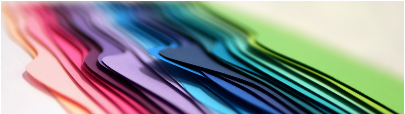
Figure 1: A physical representation of data created by a paper artist using a mix of digital design and physical crafting techniques.

Dietmar Offenhuber Northeastern University Boston, United States d.offenhuber@northeastern.edu