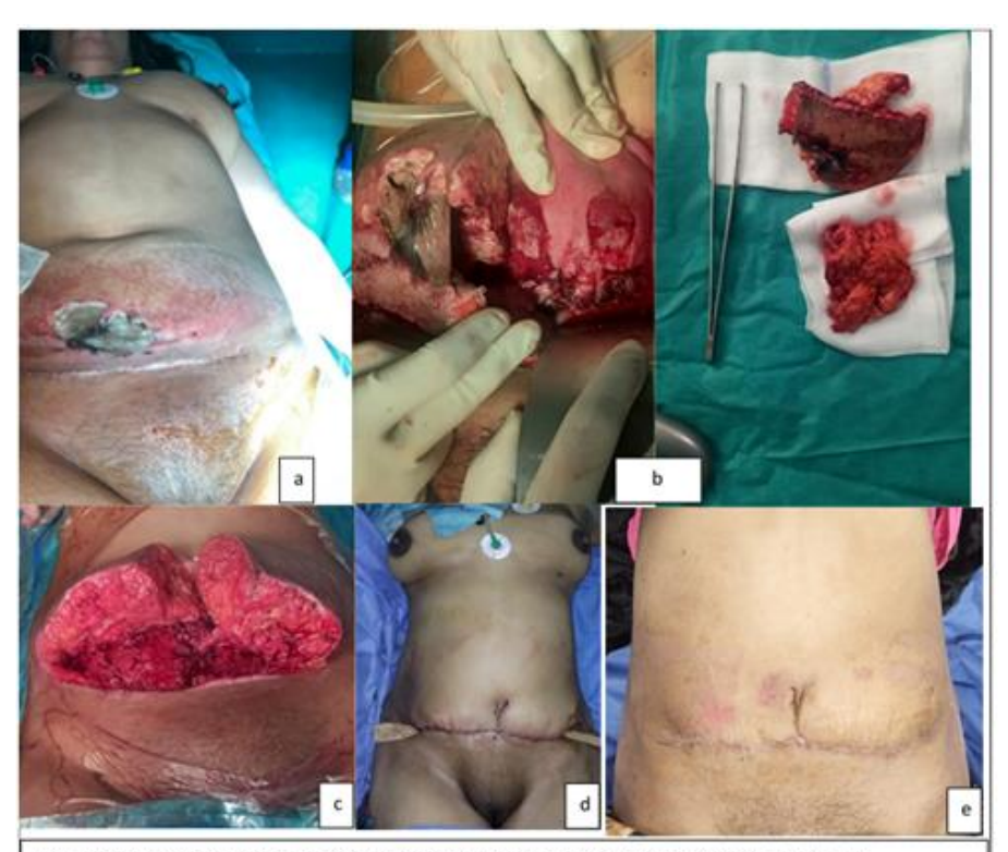
Figure 2: second case of necrotizing fasciitis associated with pelviperitonitis, a: clinical appearance on admission, b: after laparotomy we note the uterus and necrosis of the abdominal wall on both sides, and debridement product, c: after trimming the subcutaneous skin tissues and aponeurosis. d: skin closure on delbet blade. e: result after 2 months