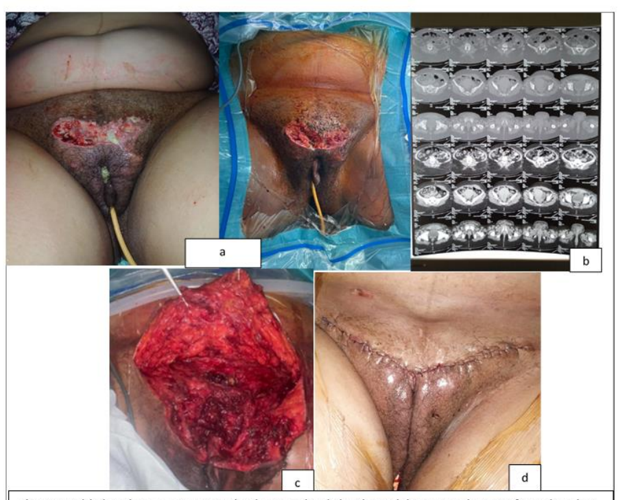
Figure 3: Third patient. a: Preoperative images. b: abdominopelvic scan. c: image after trimming, note the suprapubic opening between the two rectus major muscles. d: skin closure in the third operating stage