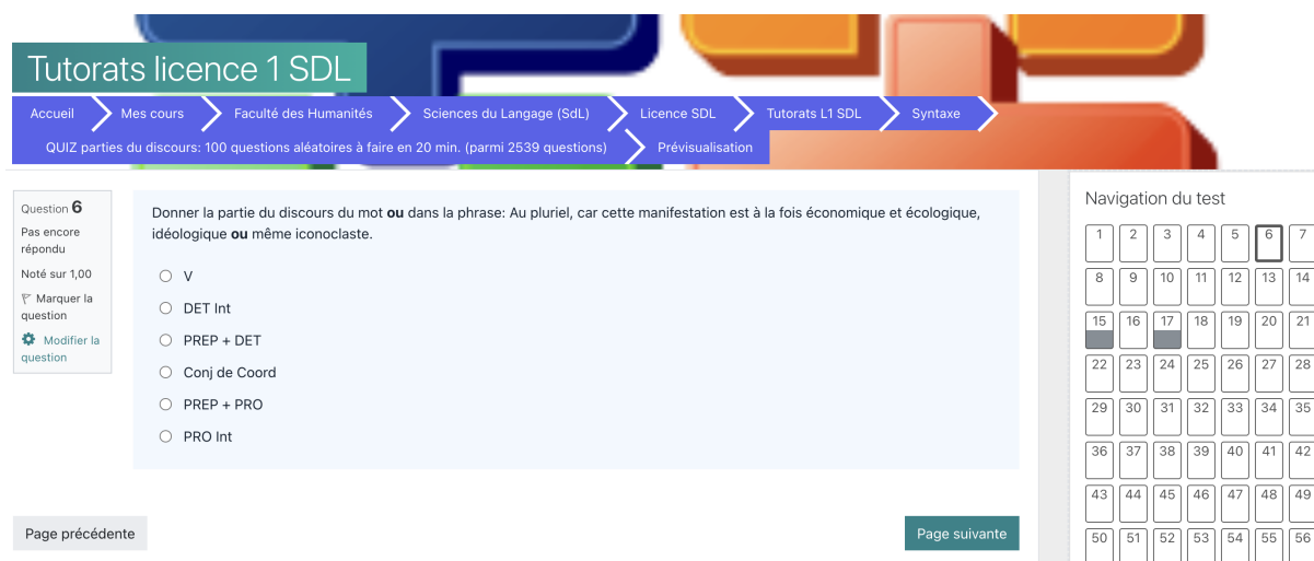
Figure 3: A parts-of-speech quiz generated from a FTB sentence

functions , by leveraging on the dependency annotations available in the CONLL-U formatted version of the corpus. Here, the expected answer is “COD” (direct object), since question is the nominal head of the NP governed by posons (ask). As can be seen, the particular question shown is part of a quiz activity comprising 40 questions.