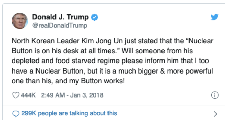
Figure 10.2. Trump’s intimidating style

it does not need to be hypocritical”. One of the redeeming traits of hypocrisy thus seems to be its capacity to keep the sword “in the scabbard” (Runciman 181). But authoritarian discourse can be proffered under democratic regimes. We only need to think of Donald Trump’s frankspeak in our post-truth era: truth seems to have become indifferent recently – The Washington Post ’s data base shows that Trump had made 18,000 false or misleading claims by his 1,170 th day in office. 2 During Trump’s presidency, traditionally tactful and polite diplomacy 3 appears to have given way to outspokenness and impoliteness on the other side of the Atlantic. Persuasive argumentation was often replaced by hot-blooded threats with potential world-wrecking consequences. Figure 10.2 recalls Trump’s memorable tweet indirectly addressed to North Korean Leader Kim Jong Un in 2018.