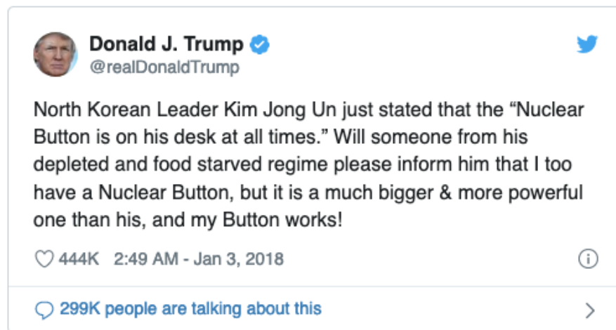
Figure 10.2. Trump’s intimidating style

it does not need to be hypocritical”. One of the redeeming traits of hypocrisy thus seems to be its capacity to keep the sword “in the scabbard” (Runciman 181). But authoritarian discourse can be proffered under democratic regimes. We only need to think of Donald Trump’s frankspeak in our post-truth era: truth seems to have become indifferent recently – The Washington Post ’s data base shows that Trump had made 18,000 false or misleading claims by his 1,170 th day in office. 2 During Trump’s presidency, traditionally tactful and polite diplomacy 3 appears to have given way to outspokenness and impoliteness on the other side of the Atlantic. Persuasive argumentation was often replaced by hot-blooded threats with potential world-wrecking consequences. Figure 10.2 recalls Trump’s memorable tweet indirectly addressed to North Korean Leader Kim Jong Un in 2018.