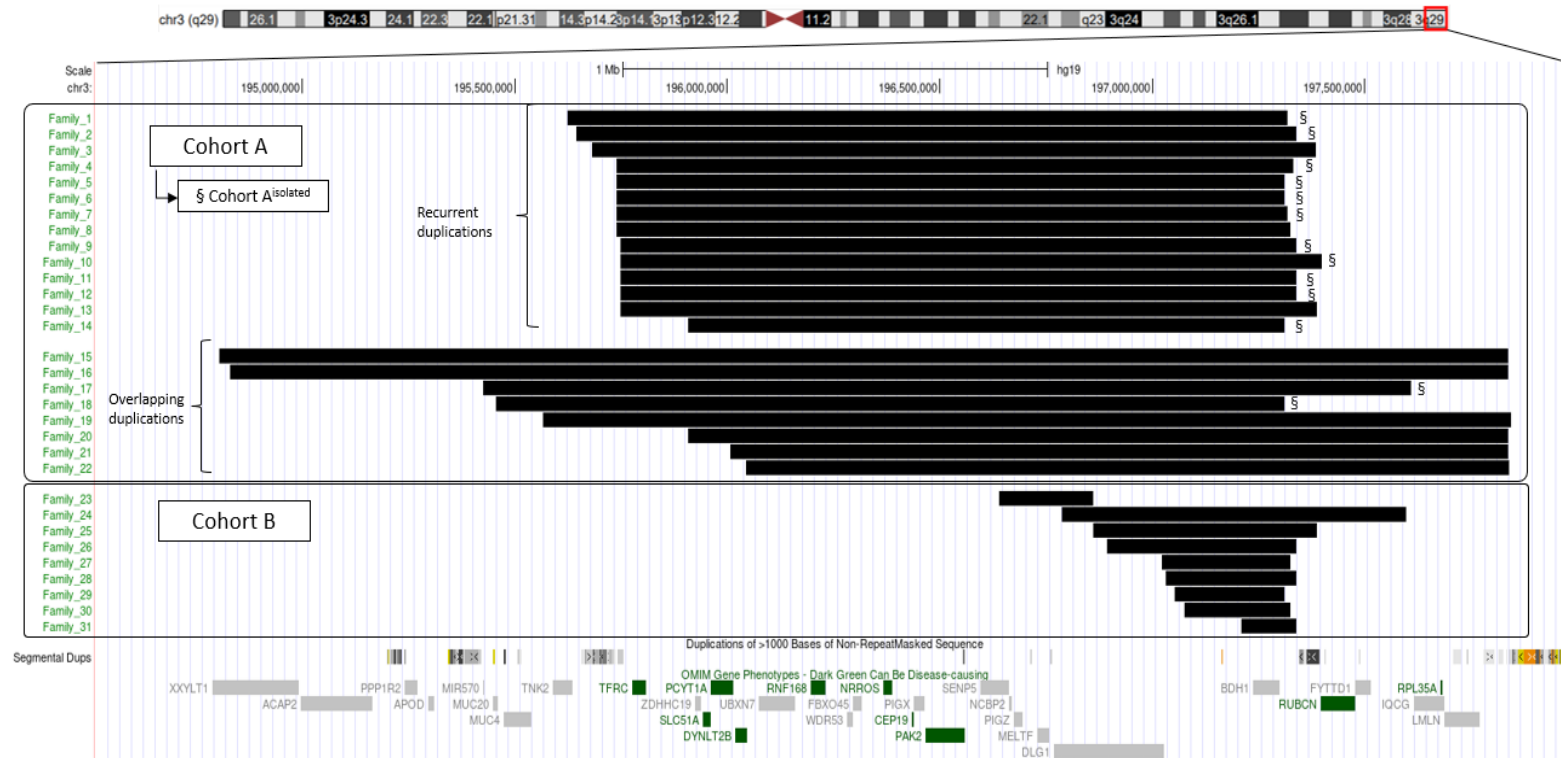
Figure 2: Mapping of duplications identified in the families of the cohort (dark bars), segmental duplications (Segmental Dups) and OMIM genes in the region Chr3: 194000000-198022430, using UCSC genome browser (build GRCh37/hg19). Cohort A includes recurrent and overlapping duplications >1 Mb and § represents families with apparently isolated 3q29 duplication (Cohort A isolated ); Cohort B includes duplications < 1 Mb

Thirty-three individuals from 22 families have a duplication included in chr3: 194803300-198810000 (GRCh37/Hg19) region (figure 2). Twenty-three patients from 14 families have the recurrent ~1.6 Mb duplication located between 195.6 Mb and 197.3 Mb of the chromosome 3. Ten patients from eight families have overlapping duplications with sizes ranging from 1.76 Mb to 3.03 Mb, six of which occurred through unbalanced translocation. The inheritance data are available for 17 patients from 14 families (table 1). Three duplications are de novo , maternally inherited in seven families and paternally in two families (including one family with four siblings). For two families, duplications are inherited from a paternal balanced translocation.