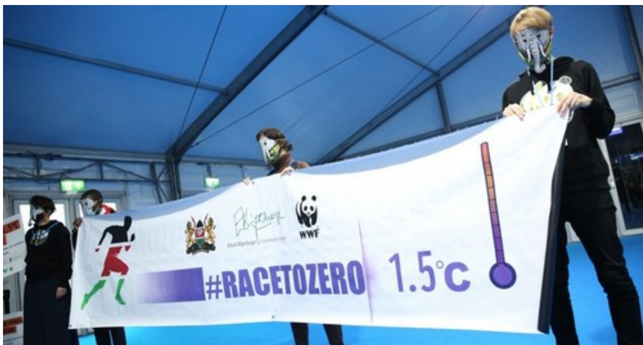
Figure 1: Civil society demonstrating for 1.5 degree objective at COP26, Glasgow, UK, November 2021. In 2014 before the Paris Agreement, national policies and measures had the world on a +3.7 C of global warming this century. Taking stock of nationally determined commitments in 2021 puts us on a +2.4 C of global warming. As we are halfway there, we are also halfway not there yet. #angry #blablabla

The COP26 in Glasgow confirmed the relevance of the 1.5 degree Celsius global warming objective. It may seem discouraging to strive for the 1.5-degree objective when Earth has already warmed by 1.1 degrees, increasing by 0.2 degrees every ten years. However, the 1.5-degree goal should be