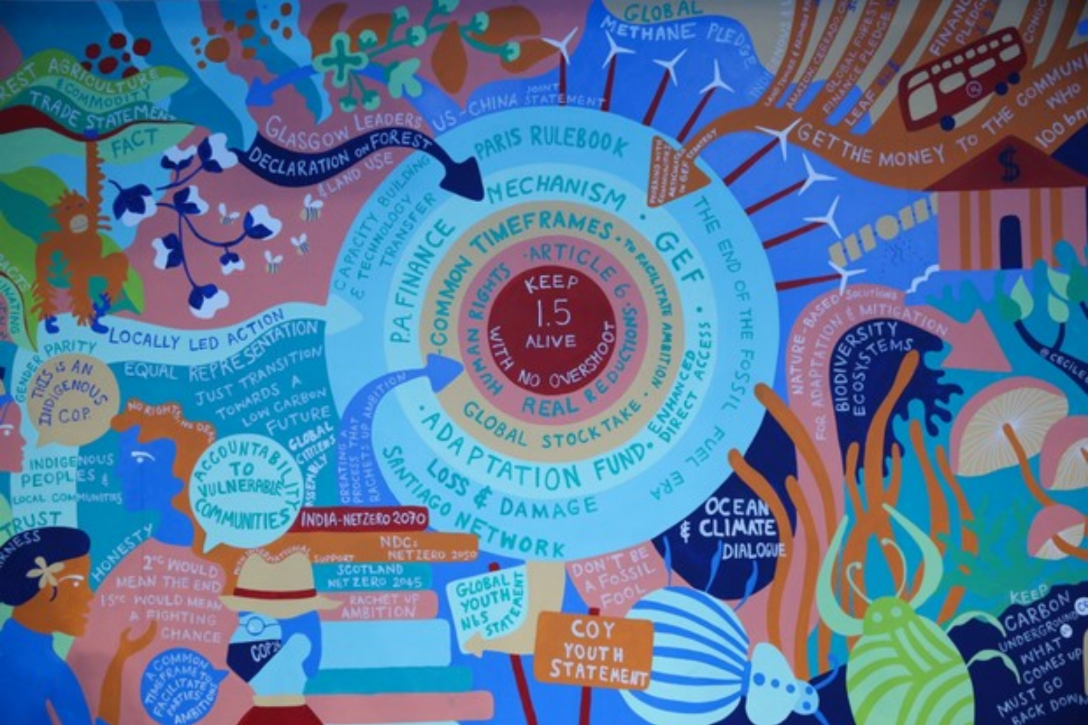
Figure 3: Around the COP26. Glasgow, UK, November 2021.

projects and to end new direct government support for unabated international coal-fired power generation (South Korea et al., 2021). Co-signatories with Vietnam include South Korea, and the Philippines, Singapore, Indonesia, and Brunei Darussalam in ASEAN. The four largest coal using countries: China, India, United States and Japan, did not sign.