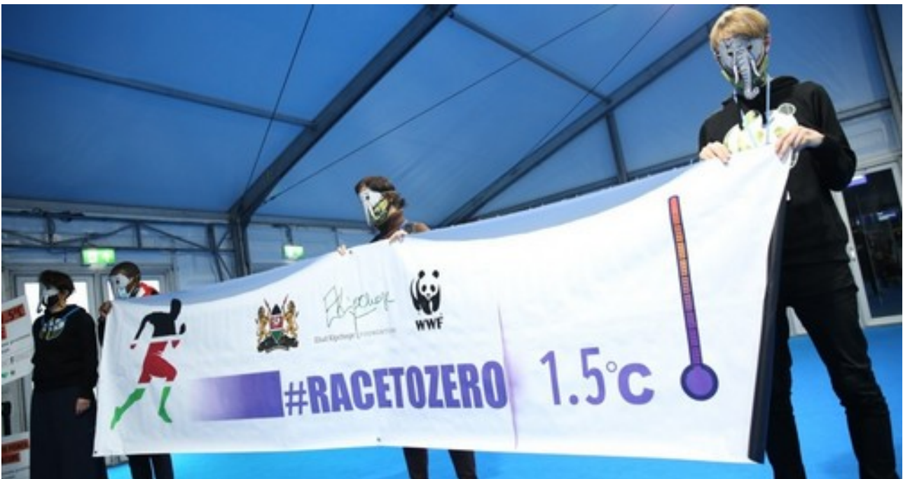
Figure 1: Civil society demonstrating for 1.5 degree objective at COP26, Glasgow, UK, November 2021. In 2014 before the Paris Agreement, national policies and measures had the world on a +3.7 C of global warming this century. Taking stock of nationally determined commitments in 2021 puts us on a +2.4 C of global warming. As we are halfway there, we are also halfway not there yet. #angry #blablabla

The COP26 in Glasgow confirmed the relevance of the 1.5 degree Celsius global warming objective. It may seem discouraging to strive for the 1.5-degree objective when Earth has already warmed by 1.1 degrees, increasing by 0.2 degrees every ten years. However, the 1.5-degree goal should be