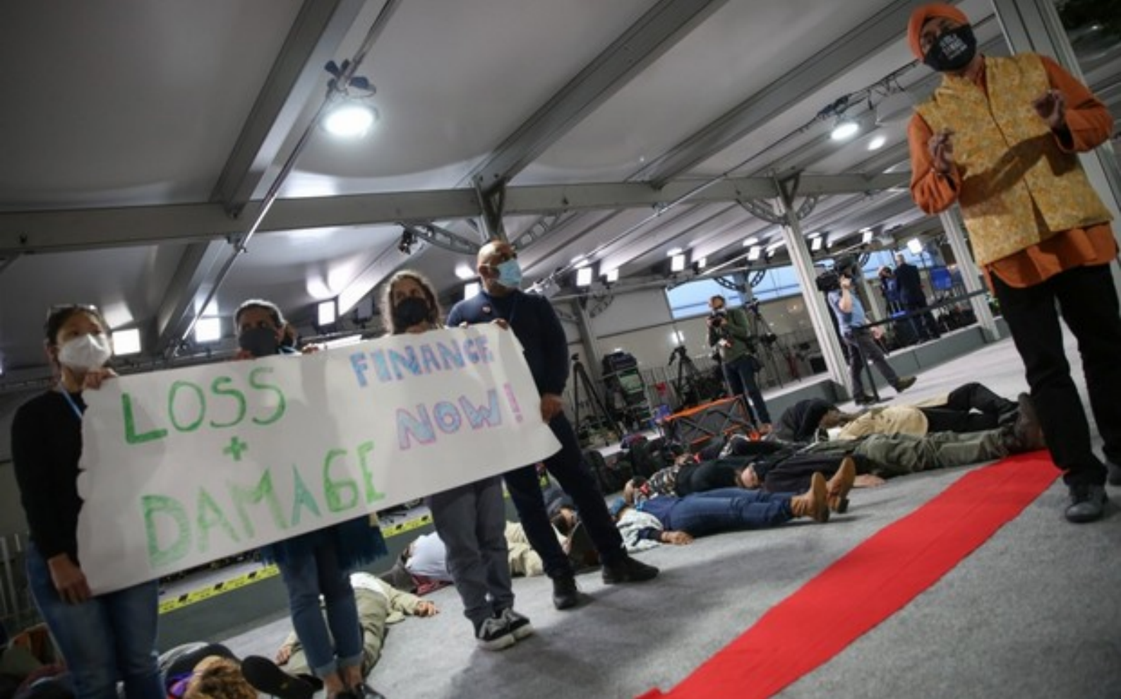
Figure 4: Future generations showing that climate change is an existential threat to some nations, requiring loss and damages finance. COP26, Glasgow, UK, November 2021.