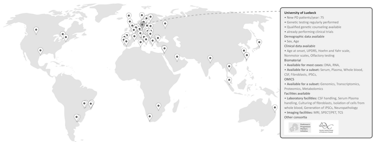
Fig 1. The monogenic resource map. This world map displays the distribution of all participating centers worldwide. The pins mark the location of the study centers. Clicking on a pin opens the respective study center profile. The profiles summarize information on the site and the availability of demographic and clinical data, biomaterials, methods, and facilities and provide information on other collaborative projects that the study center is part of.

Using a powerful team science approach, we have established a global network of academic centers involved in the clinical care of patients with monogenic PD and with a high interest in collaboration, research, and gene-targeted therapies for PD. Based on a systematic search of