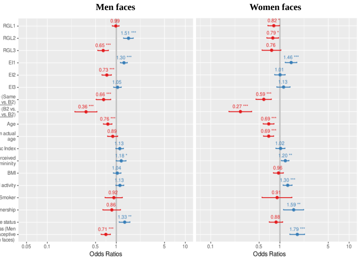
Figure 4. Graphical representation of the adjusted odd ratios with their 95% confidence intervals from the model studying the probability of being chosen in the attractiveness test for male or female faces. Raters were instructed to choose the individual found to be the most attractive between two facial photographs. RGL1, RGL2 and RGL3 are the three variables representing chronic refined carbohydrate consumption. For each variable, the difference between the two individuals (left minus right) presented was integrated into the model. For the immediate breakfast type variable, estimates are given for one category compared with the reference category corresponding to focal with B1 and non focal with B2 (underlined term). * P < 0.05 ** P < 0.01 *** P < 0.001.

709 710 711 712 713 714 715 716 717 718 719 720 721 722 723 724 725 726 727 728 729 730 731 732 733 734 735