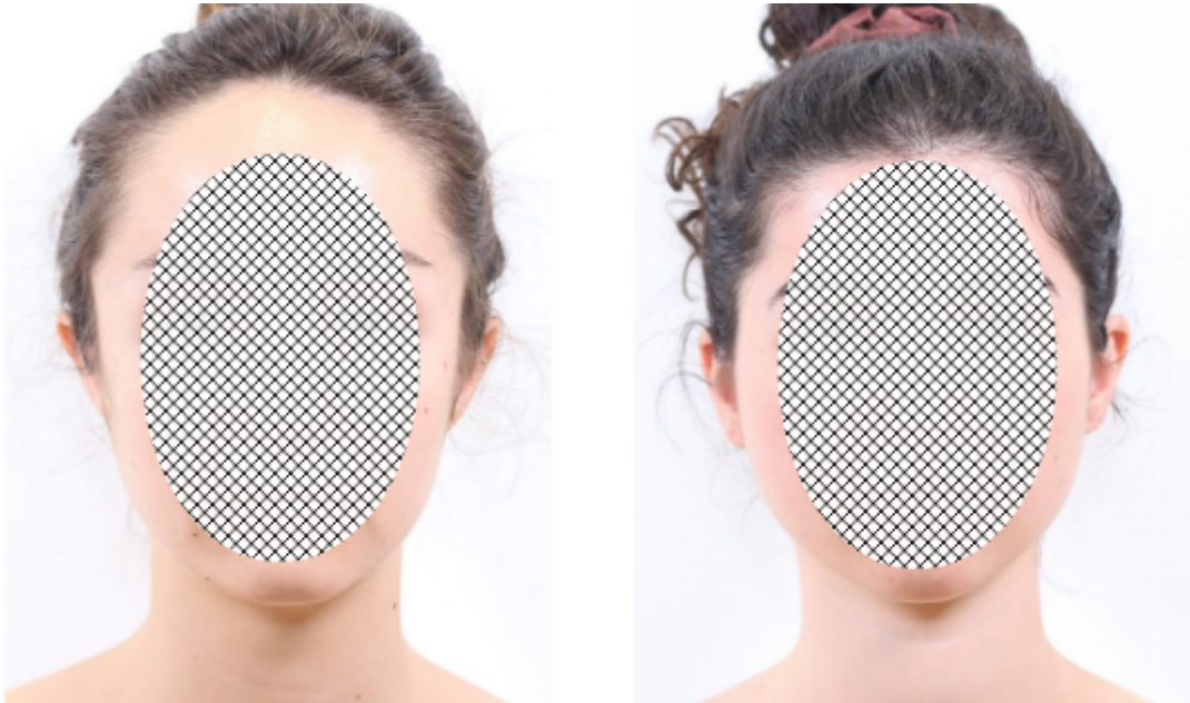
638 Figure 1. Example of a pair of faces used during the evaluation of women's facial attractiveness by male 639 raters. For each pair of women, the rater was instructed to click on the photograph of the woman that he found 640 the most attractive. Faces were anonymized for publication.