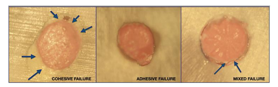
Figure 2. Samples under magnification \times 20 as observed just after push-out test illustrating the three possible bond failures. The push out test stops automatically after decohesion of the gutta-percha cone. The latter is nevertheless still visible on the pictures due to its incomplete dislodgment. The blue arrows indicate some areas showing the sealer.

There are three possible categories of failure (Figure 2): adhesive failure (no sealer left on canal walls), cohesive failure (sealer present on entire canal walls) and mixed failure (sealer in patches on canal wall).