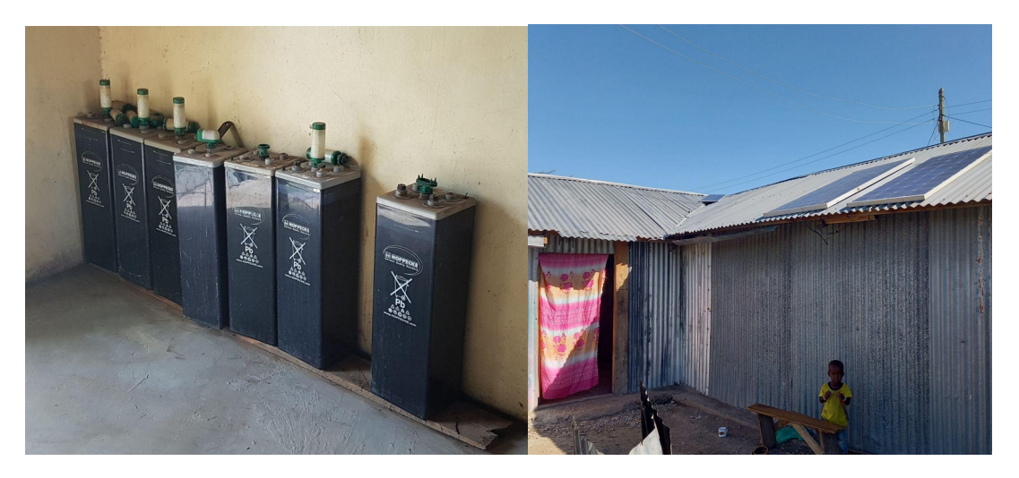
Figure 2 (left). Due to funding difficulties, only 7 of the row of 12 batteries have been replaced, although replacing the whole row is technically recommended. Source: authors, fieldwork in Kenya, May 2022.

Figure 3 (right). The barbershop is connected to the MG but is also equipped with solar panels to cope with MG outages. Source: authors, fieldwork in Kenya, May 2022.