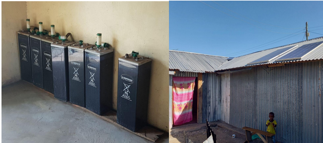
Figure 2 (left). Due to funding difficulties, only 7 of the row of 12 batteries have been replaced, although replacing the whole row is technically recommended. Source: authors, fieldwork in Kenya, May 2022.