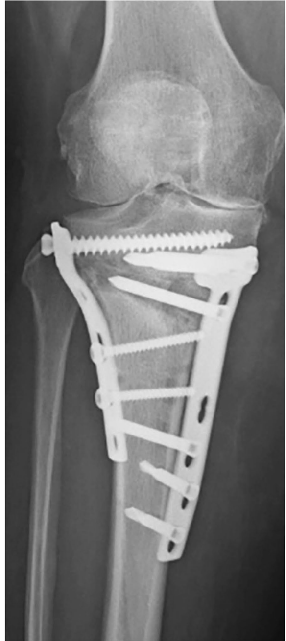
Fig. 6 Revision double plate osteosynthesis and autologous bone grafting in patient after plate rupture