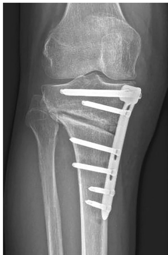
Fig. 2 Lateral widening of the osteotomy gap at 6-week follow-up. This imaging finding should prompt a CT scan (e.g., to rule out a grade II Takeuchi unstable fracture)

The first step in reducing the prevalence of hinge fractures in MOWPTO is to correctly determine the height