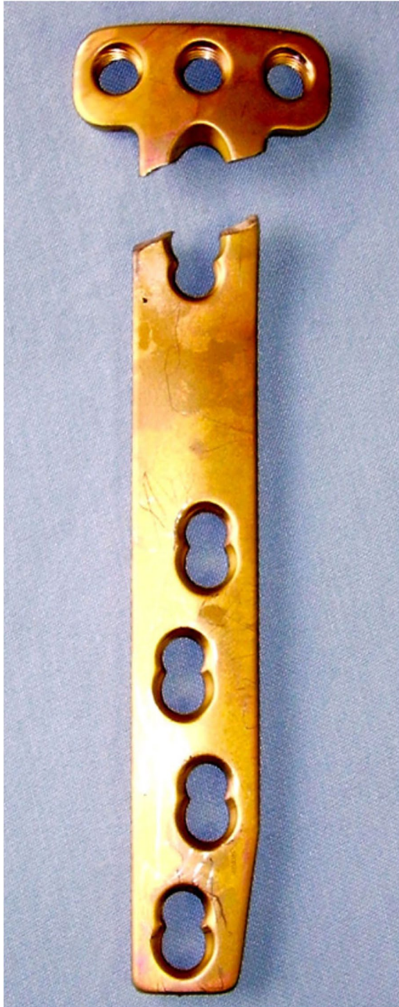
Fig. 5 Fracture of a plate fixator (Tomo-Fix, Depuy-Synthes) due to lack of occupation of the "D-hole". This has led to too high a load concentration on the plate in this area and ultimately produced the plate fracture