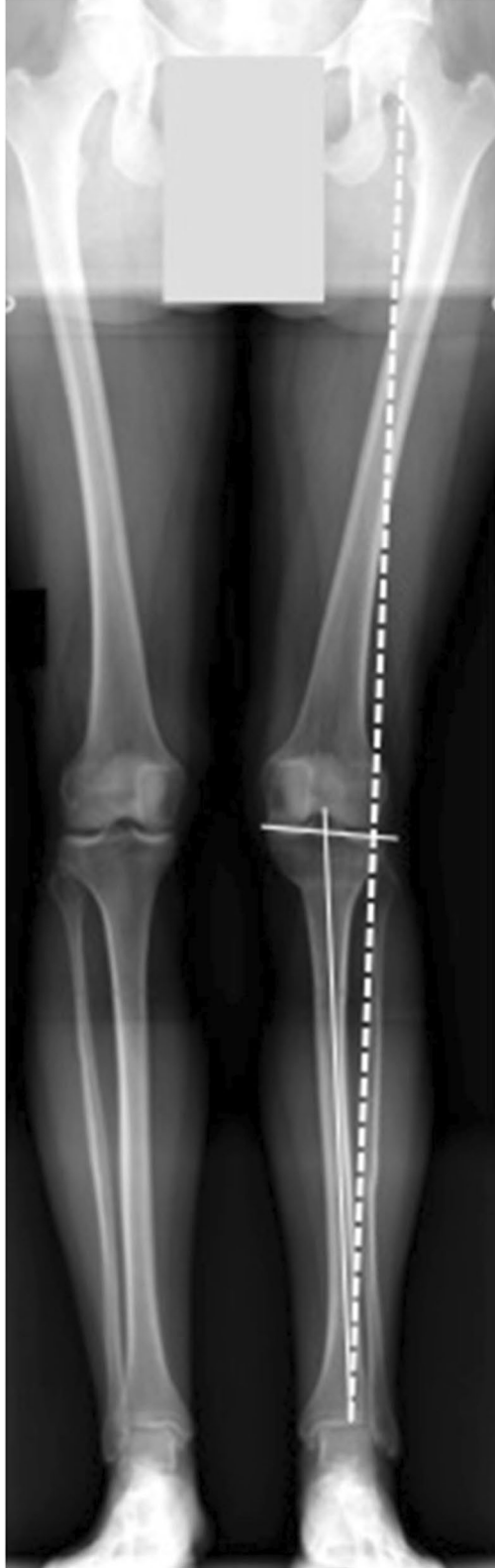
Fig. 7 Postoperative long-leg radiograph of a 48-year-old female patient after left lateral closing wedge proximal tibial osteotomy (PTO) with overcorrection. The Mikulicz line passes far laterally through the lateral joint compartment (dashed line). There was also a laterally sloping joint line that exceeded the generally accepted 5° (solid lines)

In most patients, the proximal tibia displays a preoperative medial slope inclination of 3°, with a medial proximal tibial angle (MPTA) of 87° [2]. Overcorrection may lead to an excessive inclination of the joint line and an unphysiological loading of the lateral tibiofemoral compartment, generating pathological shear forces and lateral knee pain, despite a good overall correction of limb alignment.