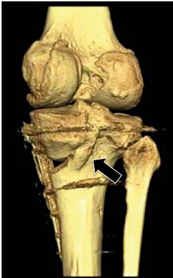
Fig. 3 The presence of posteromedial callus formation on CT scans at six or more weeks postoperatively represents an excellent prognostic factor (arrow)

of the osteotomy in the frontal plane and to perform it within the considered “safety zone” [7]. The rule of thumb is to target the proximal third of the fibular head obliquely, proximally and laterally with the first Kirschner wire used as a template, starting from the concavity of the medial tibial metaphysis. It must be noted that the height of the fibular head is variable and does not always end at about 1 cm below the tibial joint line [26].