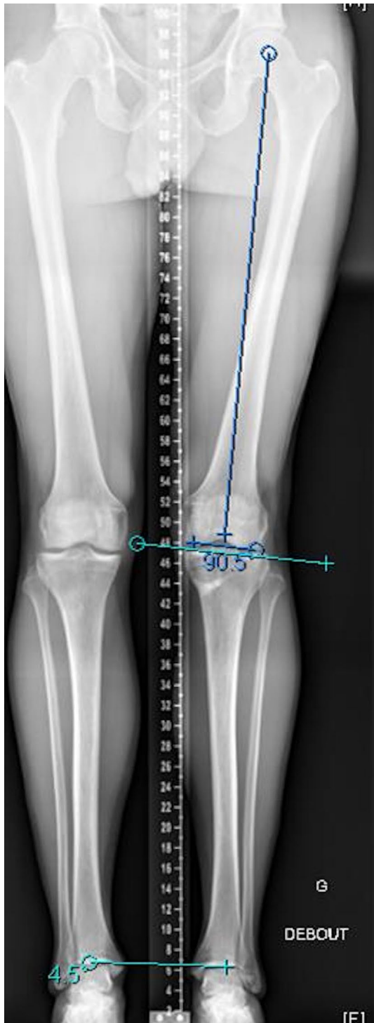
Fig. 3 Case of a patient who underwent surgery for isolated OWHO. The postoperative long leg alignment X-rays shows excessive joint line obliquity due to isolated tibial over-correction without considering the associated femoral deformity

supported by the results of Razak et al., which demonstrated a higher degree of femoral varus in patients planned for a high tibial osteotomy (HTO) with medial knee osteoarthritis