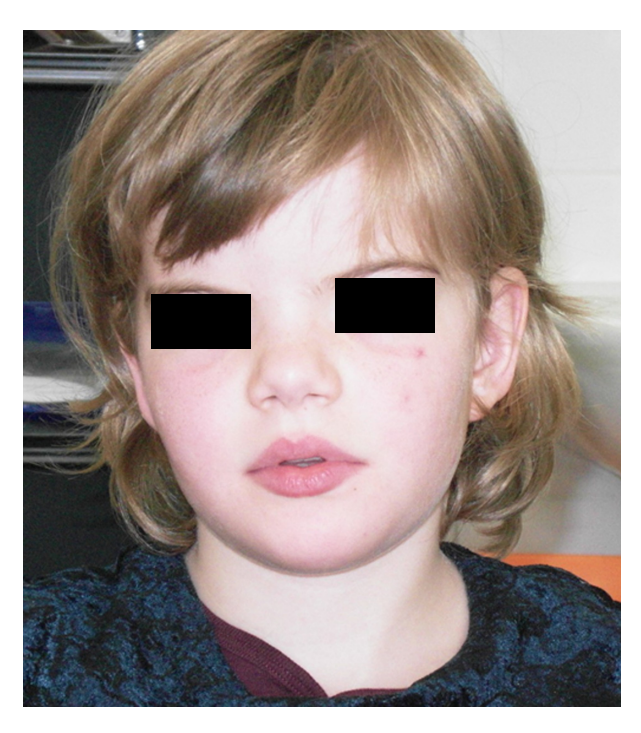
Figure 2. Clinical features of patients 4. Note edematous eyelids, bilateral epicanthus, apparent hypertelorism, a bulbous nasal tip, thick alae nasi, and thick lips.

The maternal uncle carried the same unbalanced translocation found in the child.