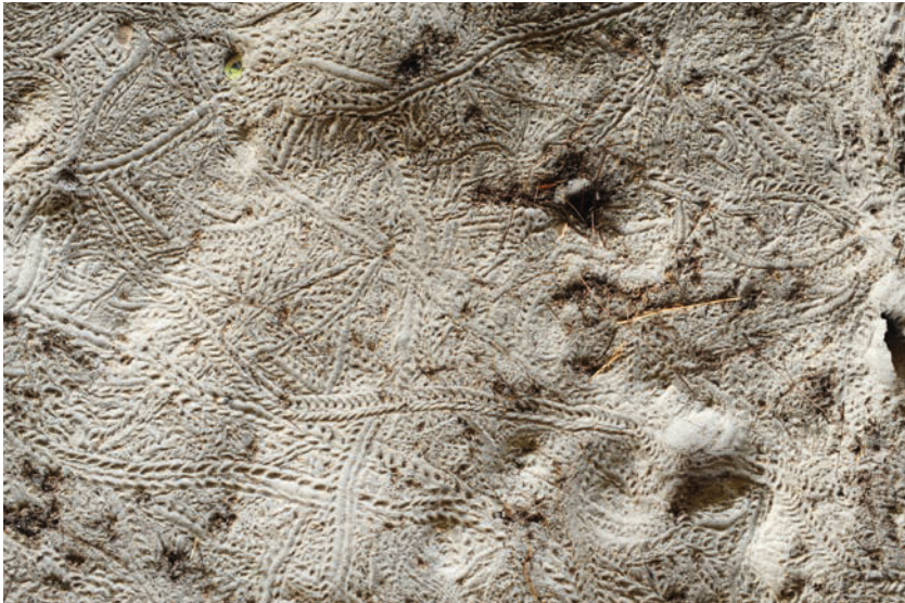
Traces in the sand (probably beetles) in Kumawa (Indonesia).