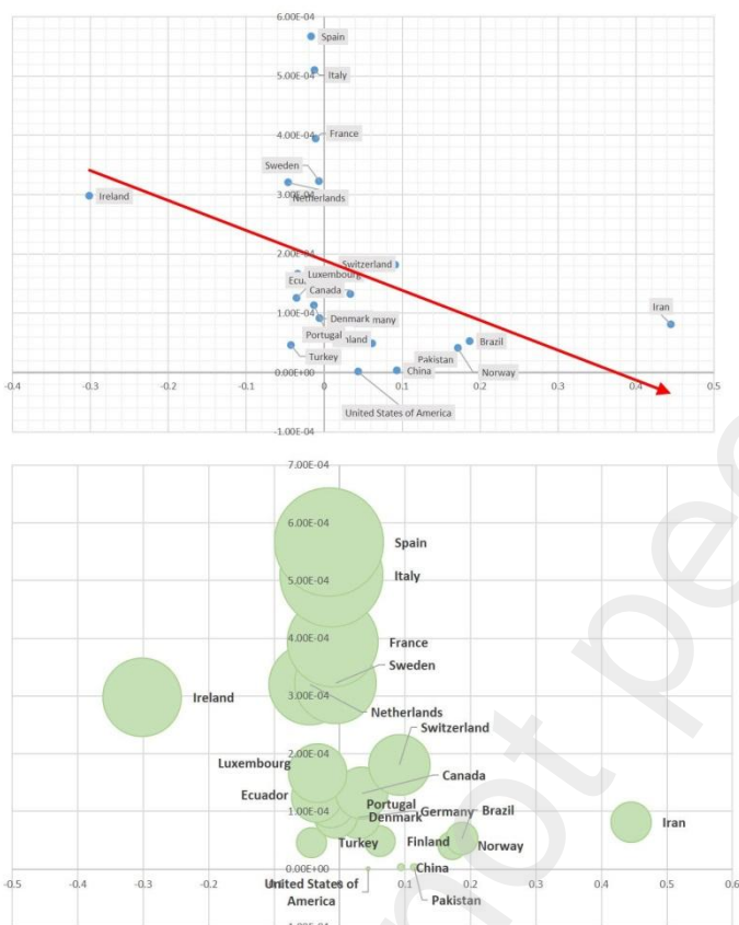
Figure 1: Health Expenditures change (2013-17) versus Covid-19 mortality rates

Note : lagged covariates have been used as instruments to compute GMM regressions