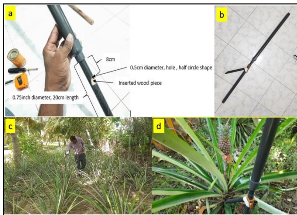
Figure 02: a) Parts of developed tool; b) Final view of developed tool; c) Field evaluation of developed tool; d) applying fertilizer at the leaf base of pineapple plants

The rubber band is tightly fastened to the fixed piece, while the screw is connected to the movable piece. When the movable piece is pressed downward, it moves easily, but it returns to its original position with the aid of the rubber band. The open ends of both pieces meet together when the movable piece is pushed down. This action triggers the release of fertilizer, a process that occurs within seconds. The released fertilizer flows through the outlet end of the instrument, targeting the base of the pineapple crop. To utilize this tool effectively, fertilizer must be loaded into the fixed piece, which has a narrower PVC structure, creating the necessary pressure for the fertilizer to descend. By pushing the fertilizer container, minor pressure is applied to the long PVC pipes, facilitating the controlled release of the fertilizer.