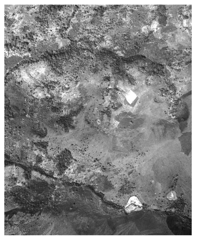
FIGURE 2 An aerial photograph from 1953 reveals swiddens at Bu Gler, Mondulkiri province, Cambodia