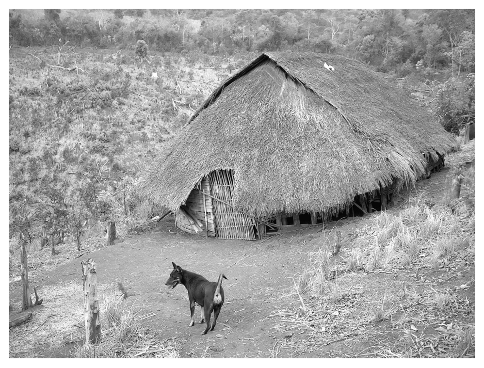
FIGURE 3 A Mnong house on a swidden in Mondulkiri province, Cambodia

The prohibition of swidden has to be understood in the broader context of the colonial administration's willingness to strongly regulate use of the forest by villagers in all of French Indochina (Thomas, 2000). When France established its domination over Indochina, it aimed at imposing the paramountcy of a modern European state.