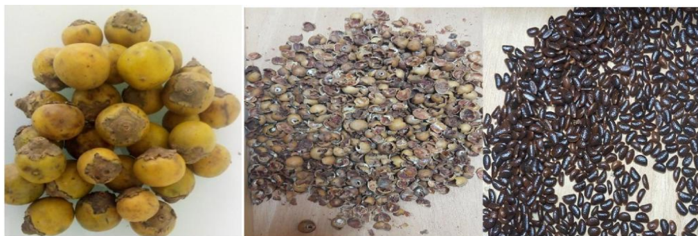
a. Whole fruits