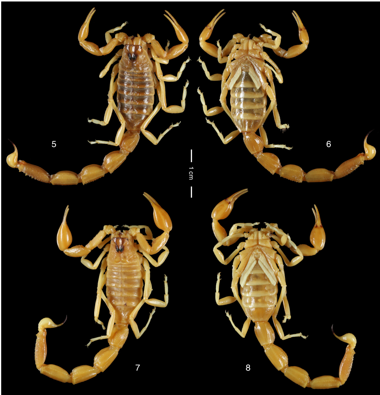
Fig. 5-8. Buthacus deserticus sp. n., habitus.

5-6. ♀ holotype, dorsal (5) and ventral (6) aspects. 7-8. ♂ paratype, dorsal (7) and ventral (8) aspects.