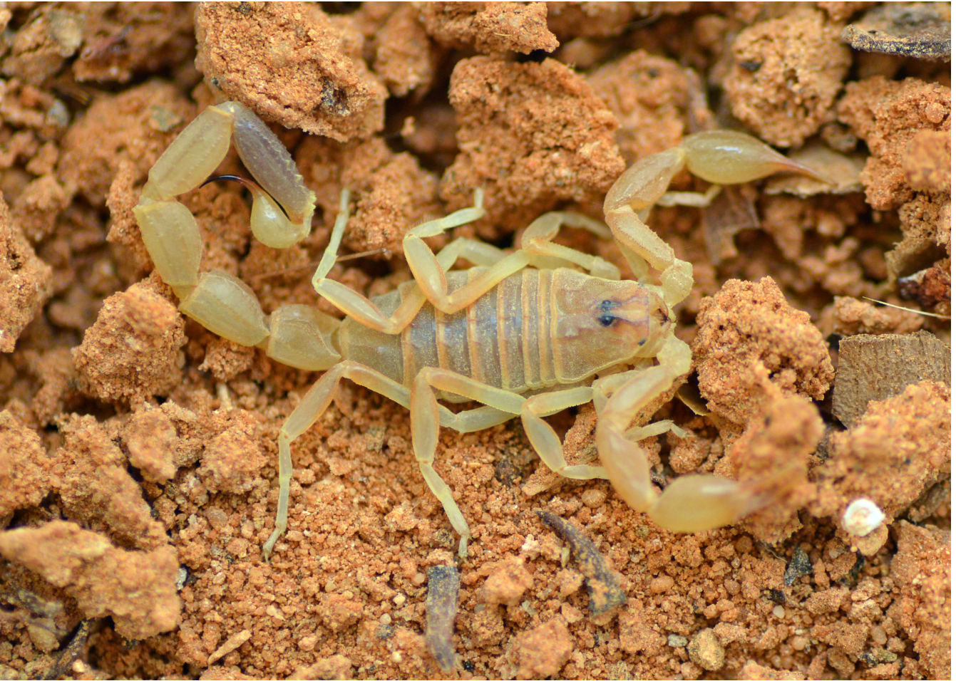
Fig. 15. Buthacus deserticus sp. n., ♂ paratype alive in its natural habitat (Dhayet Bendhahoua, Ghardaïa, Central Algeria).