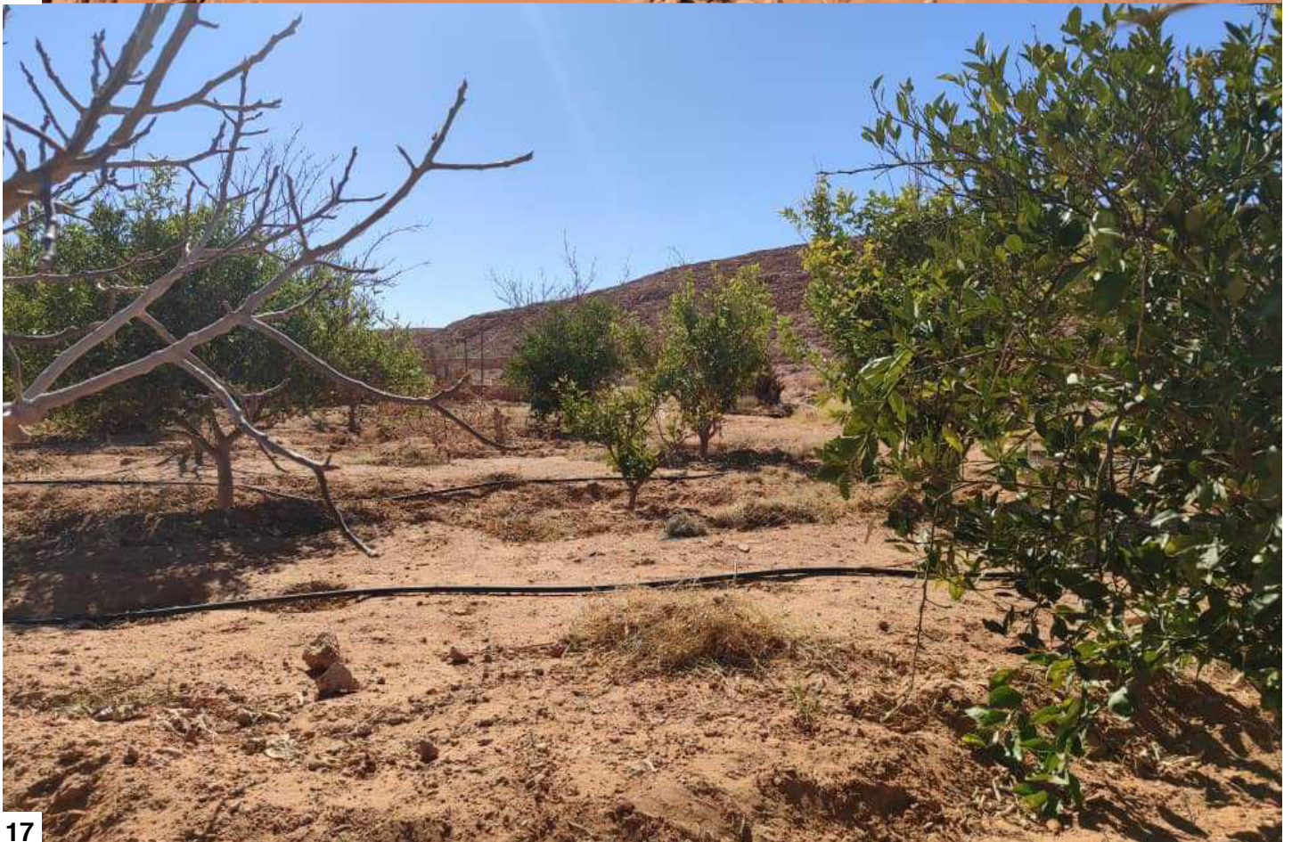
Fig. 16-17. Natural habitats of Buthacus deserticus sp. n. in Dhayet Bendhahoua (16) and Beni Isguen (17), Ghardaïa, Central Algeria.