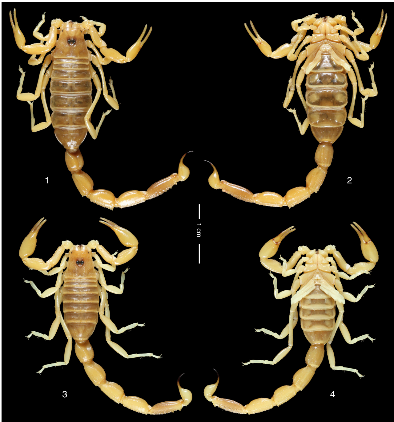
Fig. 1-4. Buthacus spinatus , habitus.

Illustrations and measurements were made with the aid of a Wild M5 stereo-microscope with a drawing tube (camera lucida) and an ocular micrometer, Habitus photographs were made with a Canon EOS 7D and Adobe Photoshop software. Map was made using Adobe Photoshop software. Measurements follow Stahnke (1971) and are given in mm. Trichobothrial notations follow Vachon (1974) and morphological terminology mostly follows Vachon (1952) and Hjelle (1990). Material studied herein is deposited in the MNHN (Muséum national d’Histoire naturelle, Paris, France) and EYCP (Eric Ythier Private Collection, Romanèche-Thorins, France).