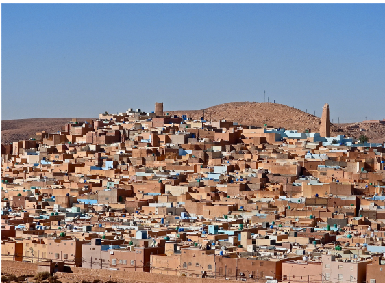
Illustration de la couverture :