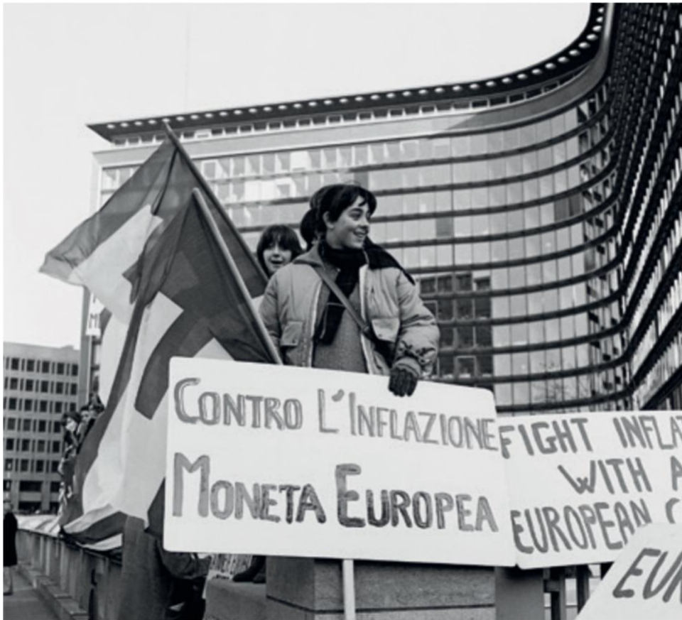
Figure 10.1. Young people demonstrate in support of a European currency in front of the European Commission headquarters (the Berlaymont) on 5 December 1977.

In late 1977, Roy Jenkins, the President of the European Commission, delivered a speech in Florence where he called for a European monetary union. Shortly after, in 1978, French President Valéry Giscard-d'Estaing and German Chancellor Helmut Schmidt pushed for negotiating a new system, which entered into force in 1979: the European Monetary System (EMS). The European Council, a new EEC institution created in 1974 in which the heads of state meet, had also been an important player in the construction of this new system (chapter 3). The EMS was in many aspects similar to the snake. However, it added three new elements: a divergence indicator, credit mechanisms, and a European Currency Unit (ECU), a currency basket, in which all participating EEC currencies were entered with different weightings. As it was the strongest currency, the deutschmark tended in practice to be at the centre of the system.