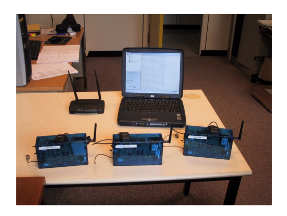
Figure 4 . The wireless platform.