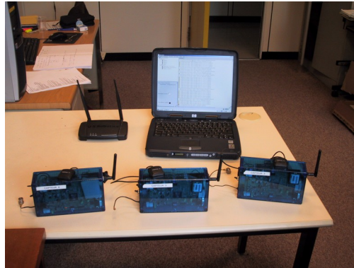
Figure 4 . The wireless platform.